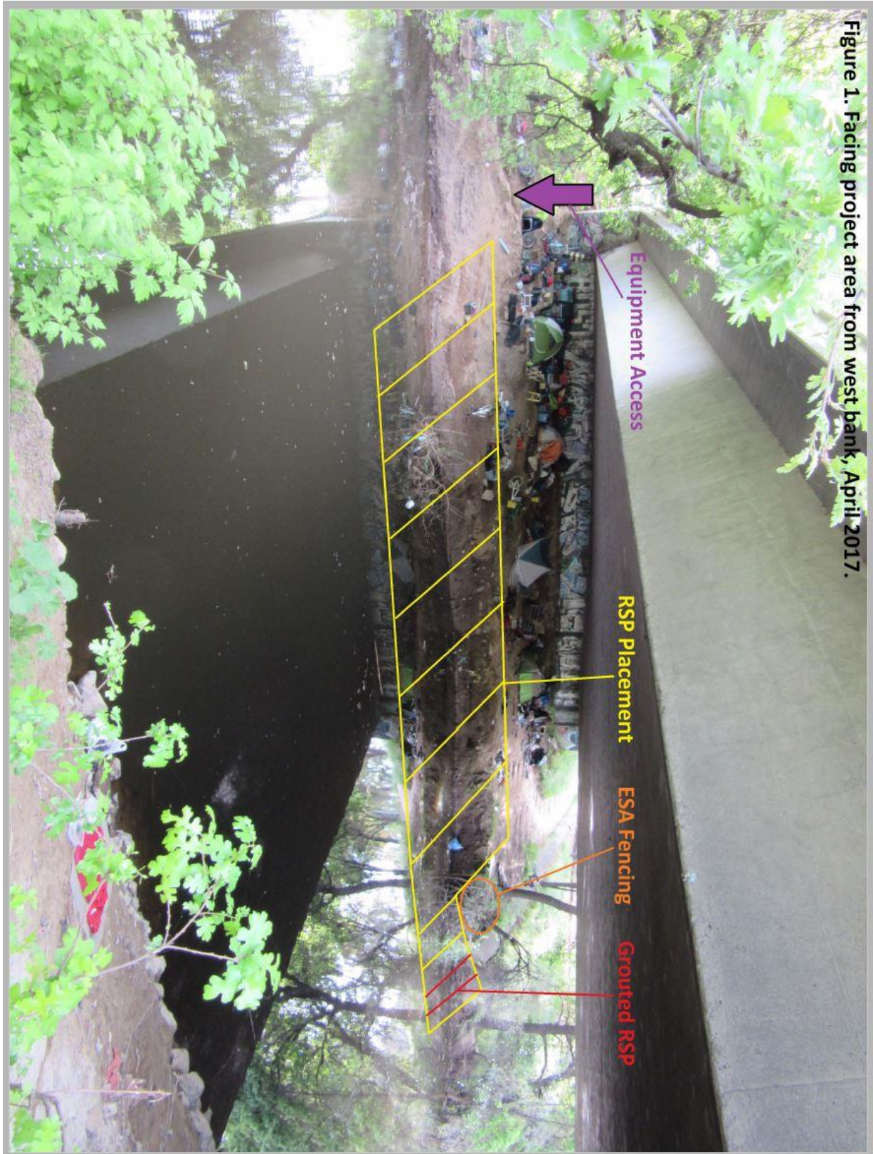
Figure 2 – Project Site Map