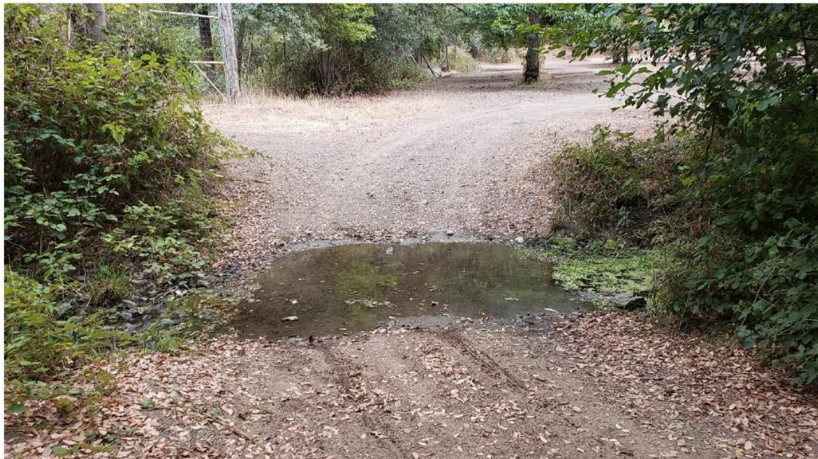
Figure 1 – Project Location Map and Crossing Location Photograph