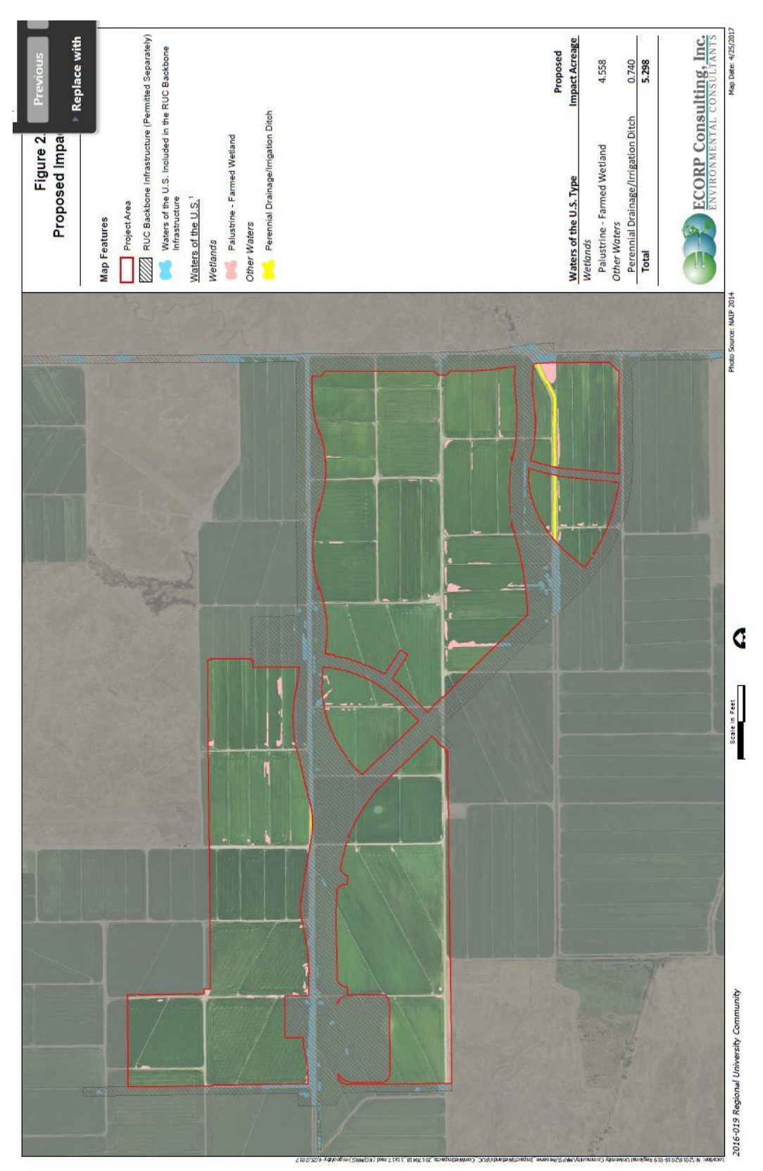
Figure 2 – Project Site Map