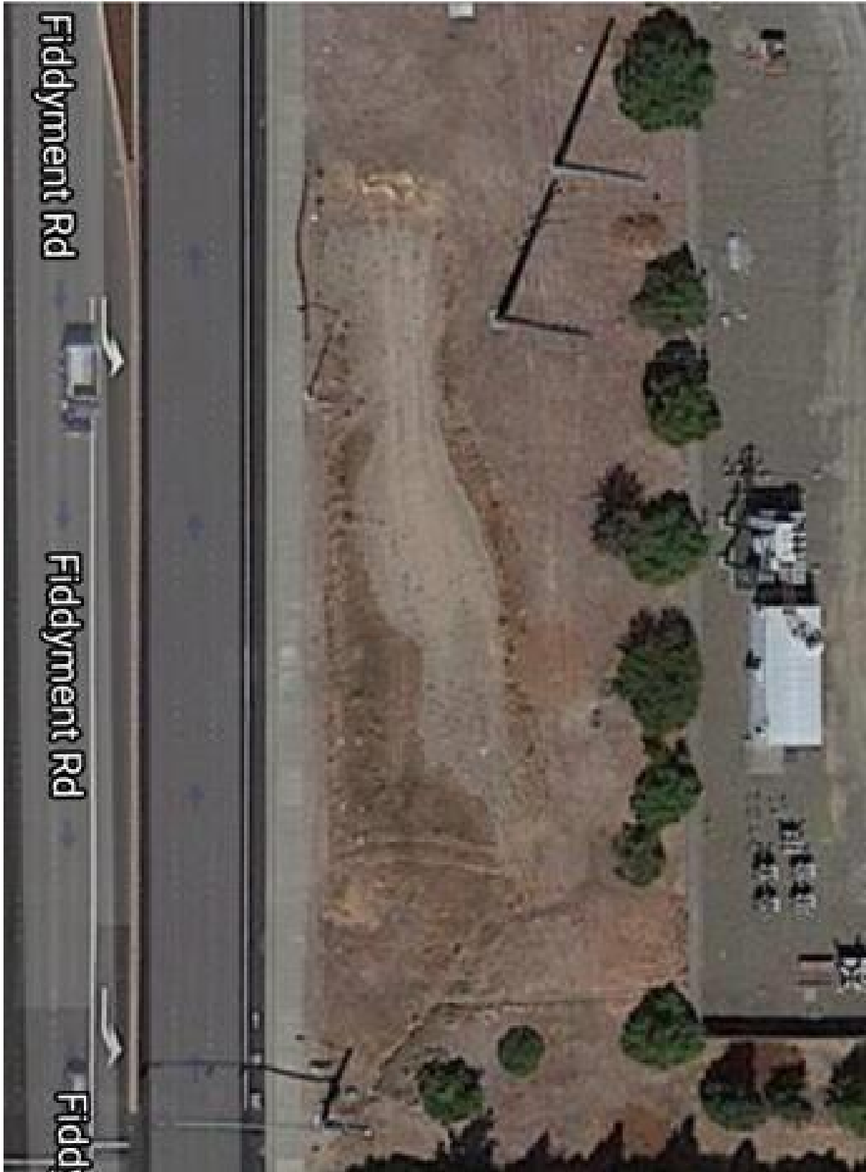
Figure 2 – Project Site Map