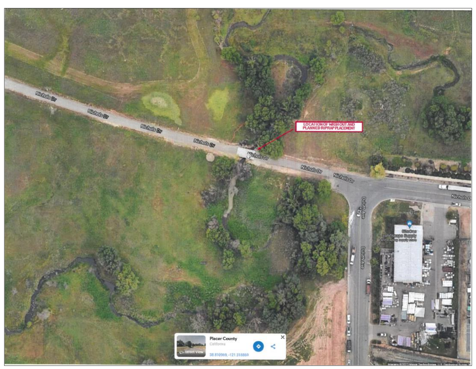
Figure 2: Project Location Map