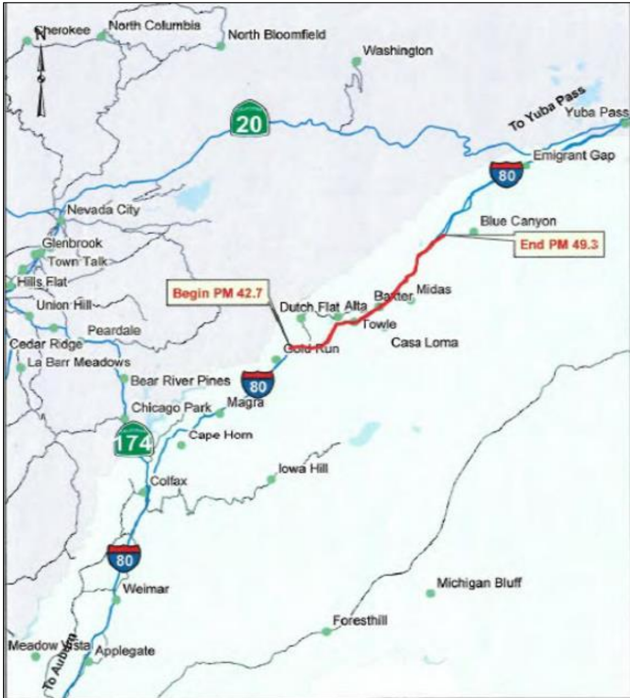
Figure 1: Project Vicinity Map