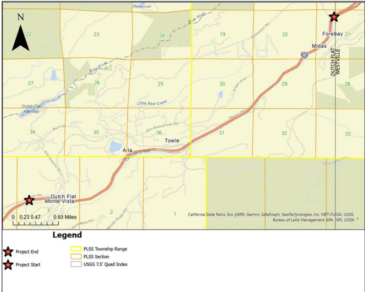
Figure 2: Project Location Map