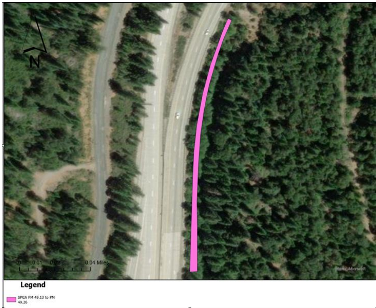
Figure 6: Project Impacts Map for Soldier Pile Ground Anchor Wall from PM 49.13 to PM 49.26