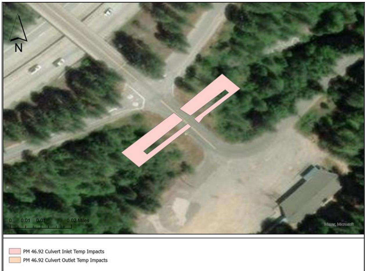
Figure 3: Project Impacts Map Culvert at PM 46.92