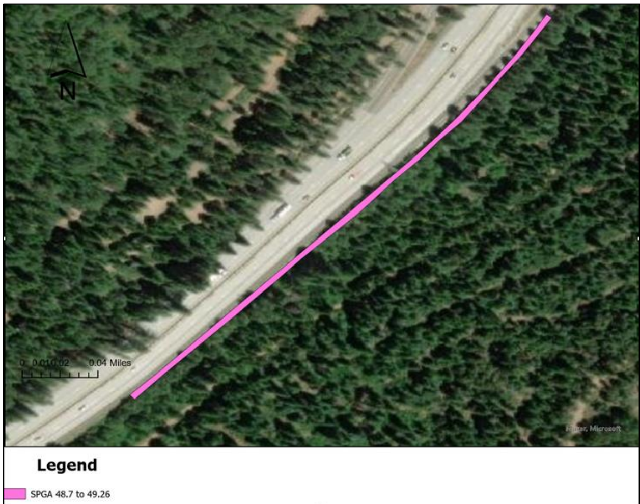
Figure 5: Project Impacts Map for Soldier Pile Ground Anchor Wall from PM 48.7 to PM 48.92