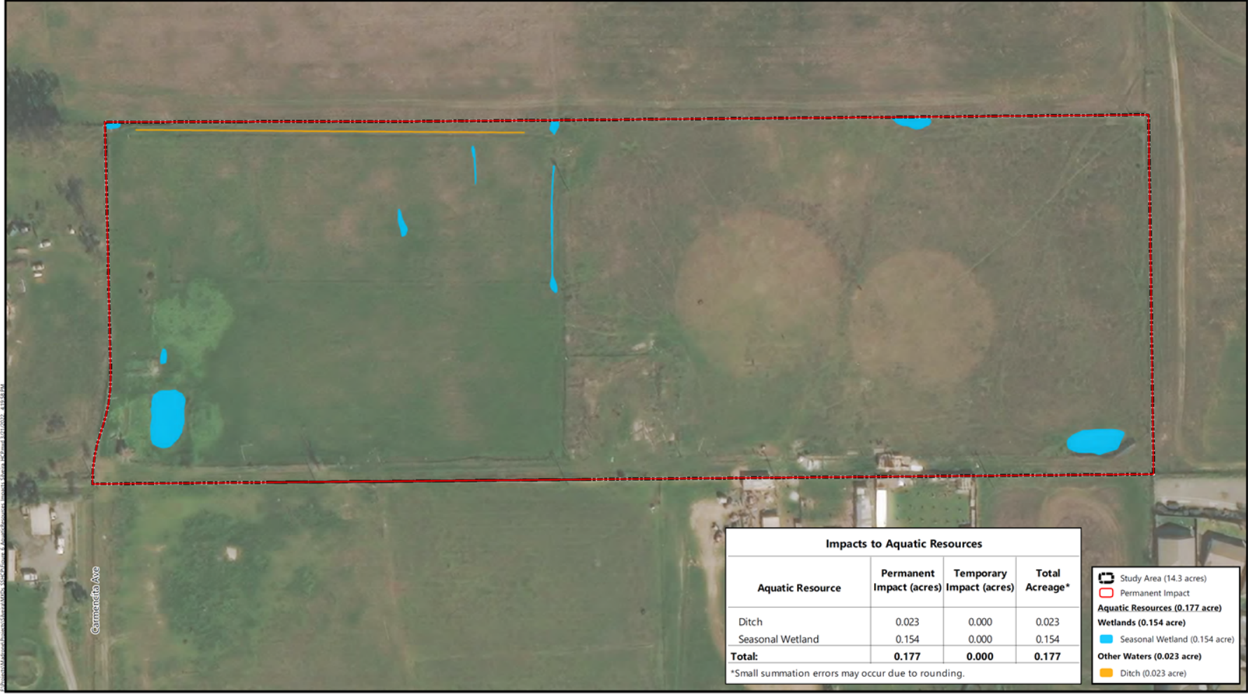
Figure 2: Site Impact Map