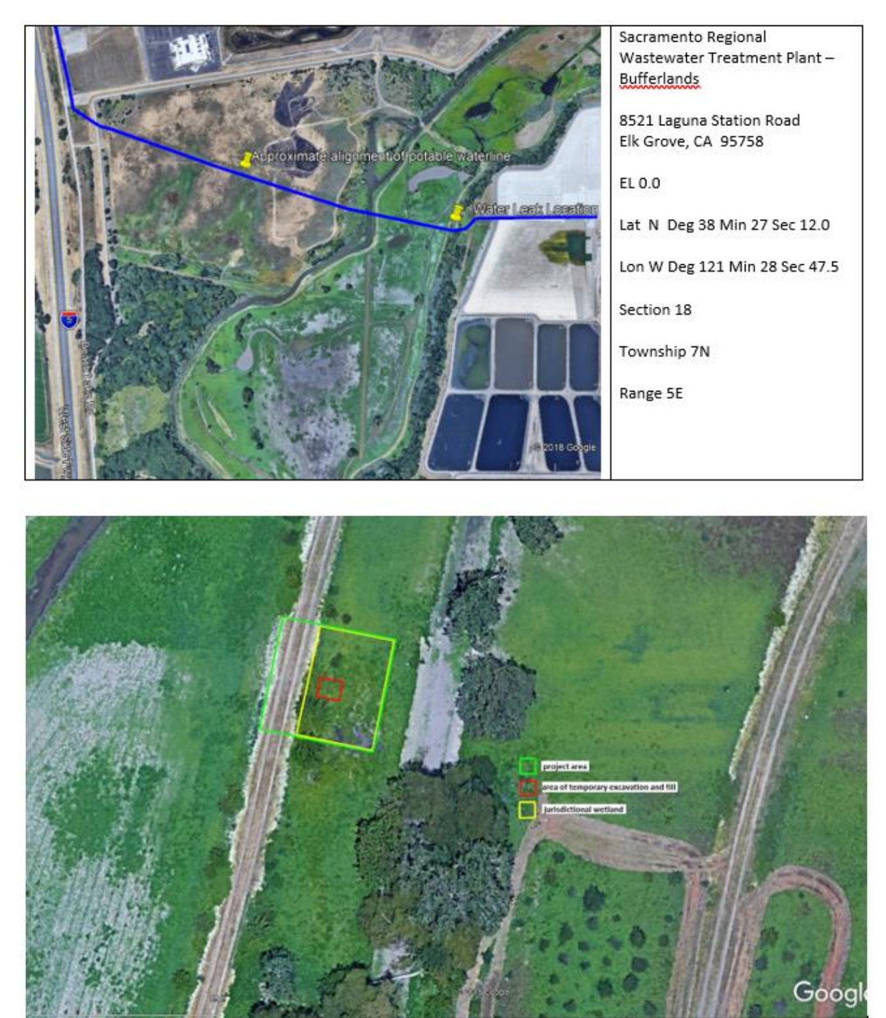
Figure 2 – Site Impact Map