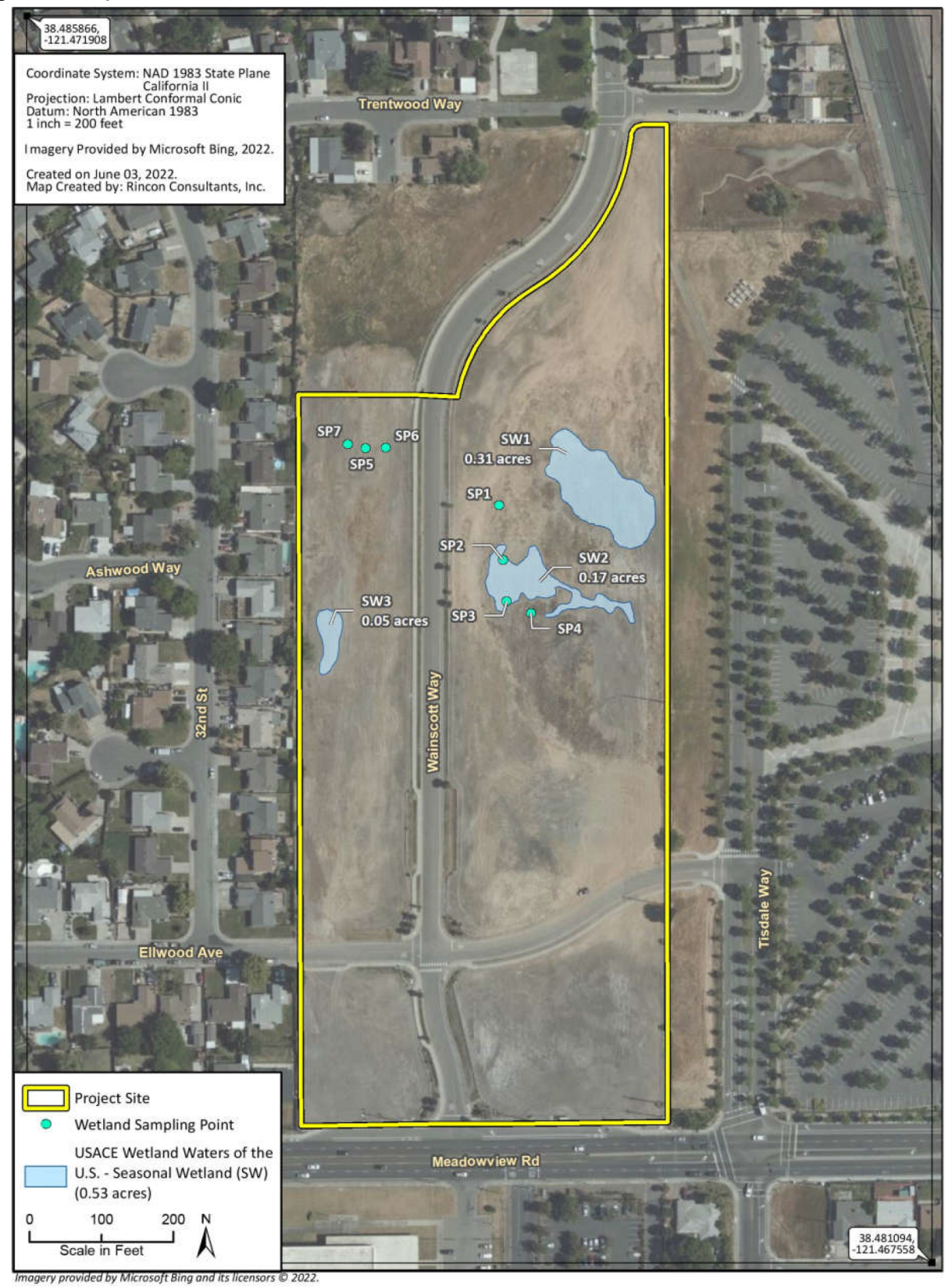
Figure 2: Aquatic Resources