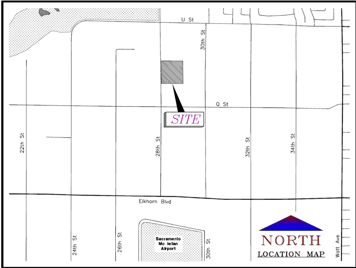
Figure 1: Project Location Map