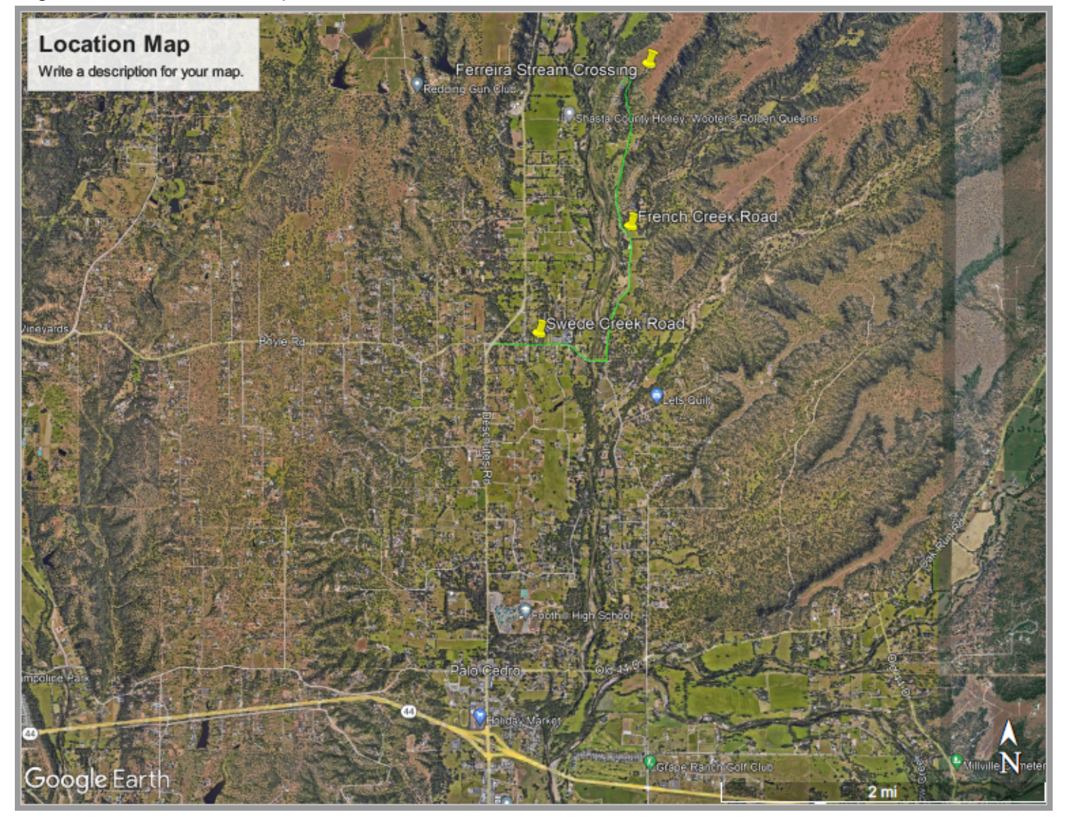
Figure 1. Site Location Map