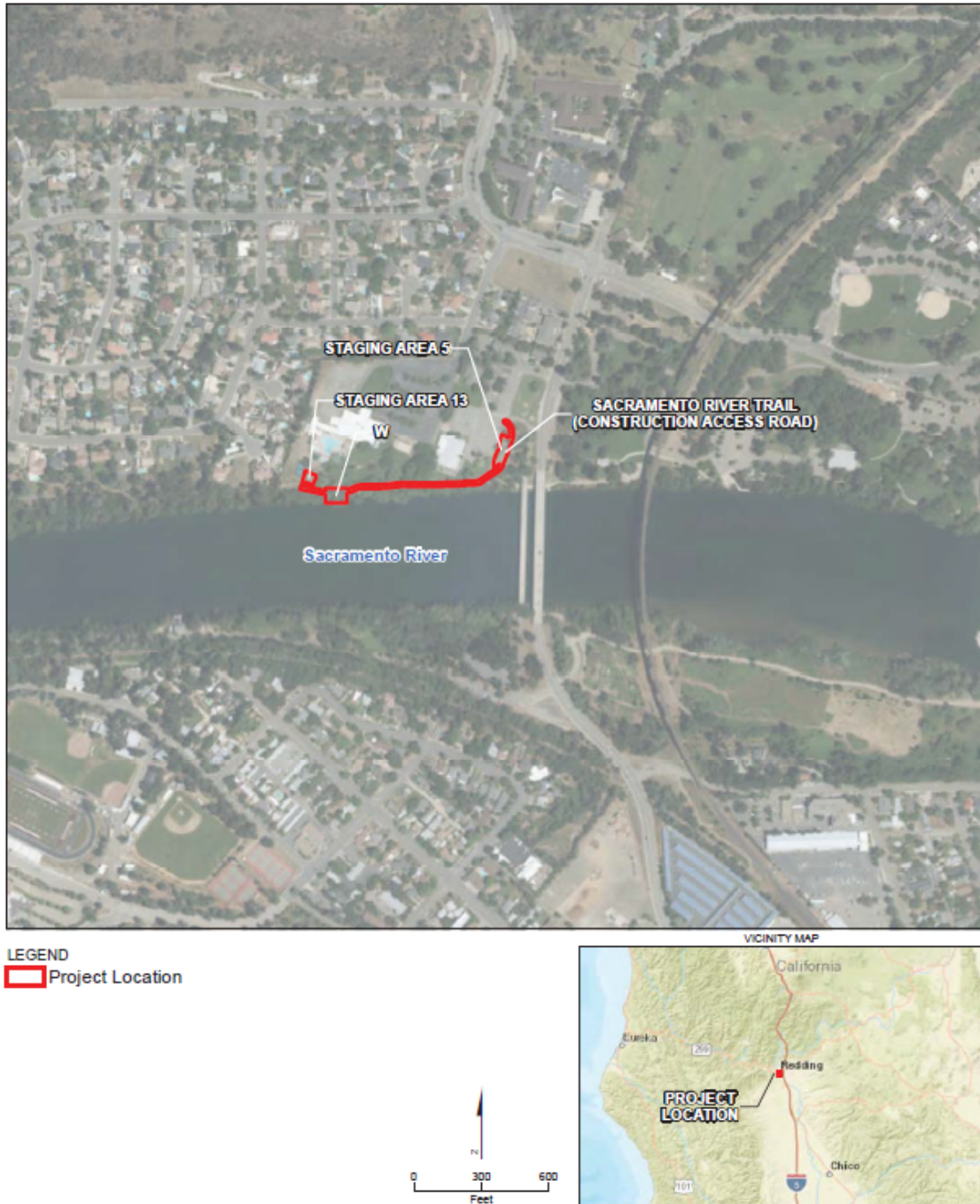
Figure 1: Project Location Map