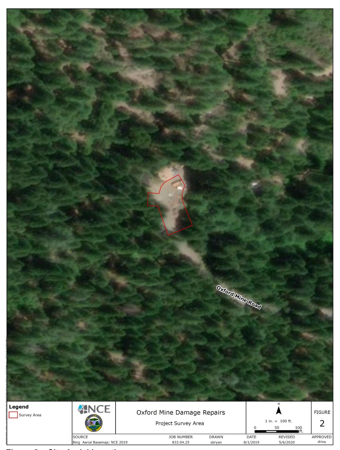
Figure 2 – Site Aerial Location