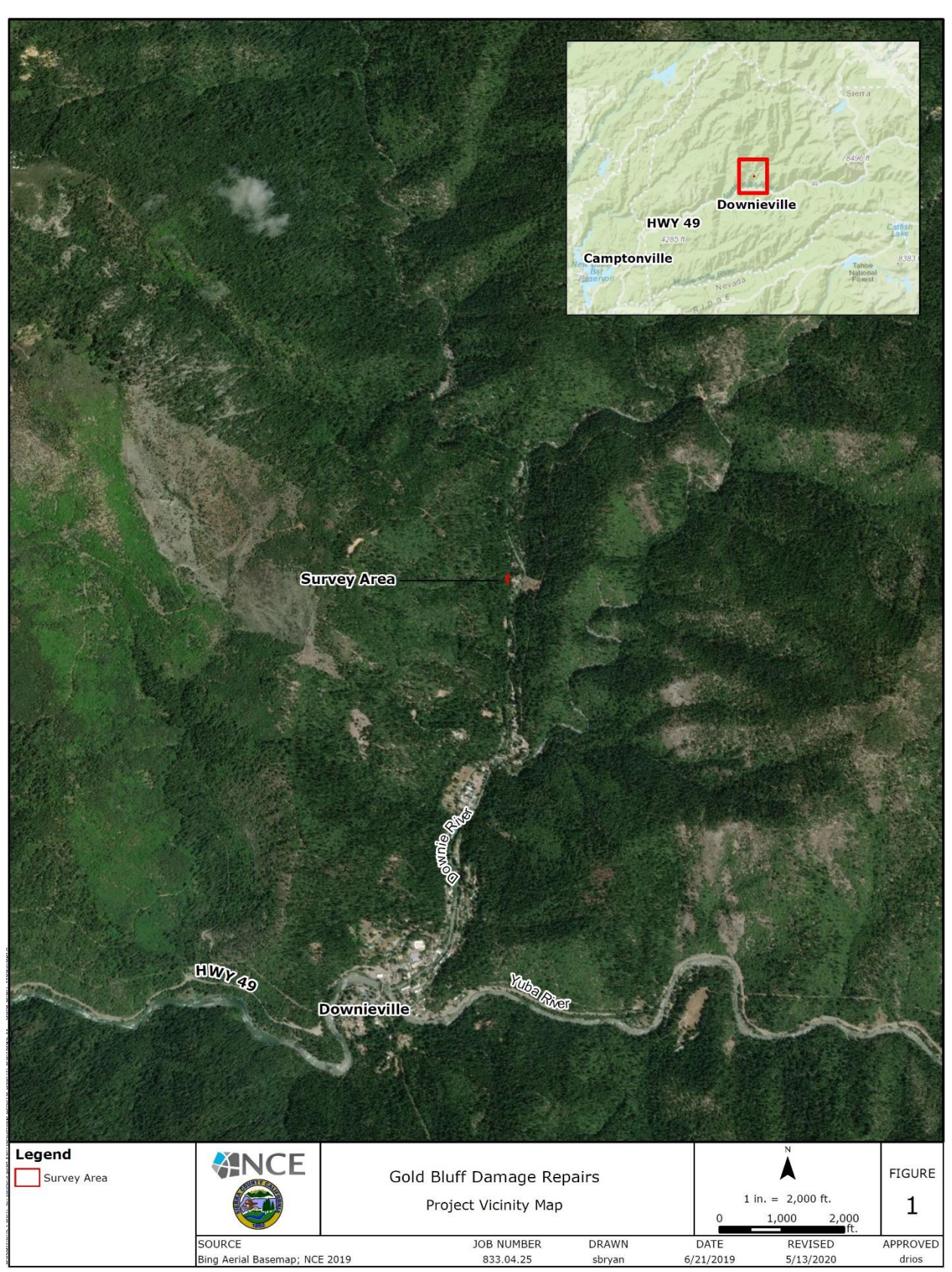
Figure 1 – Project Location Map