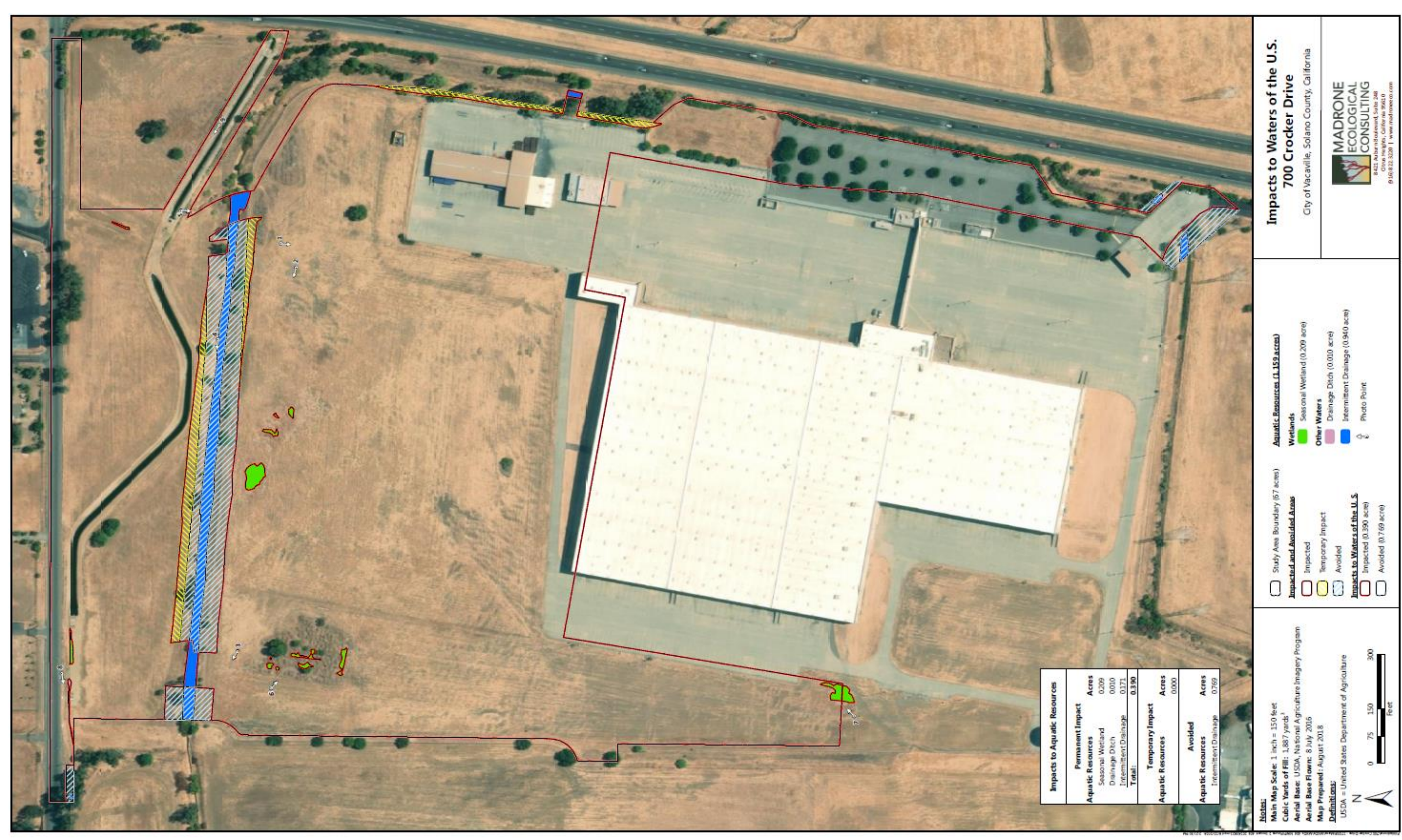
Figure 2 – Site Impact Map