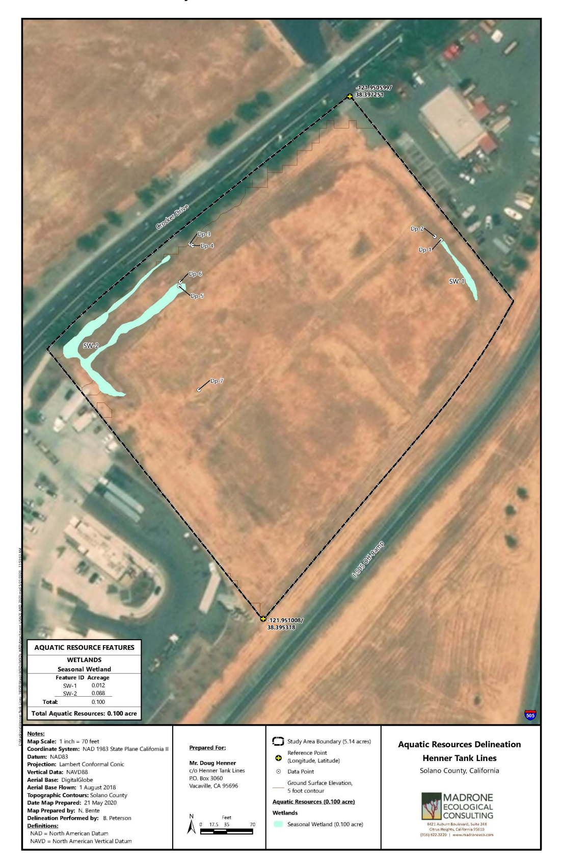
Figure 2—Site Impact Map