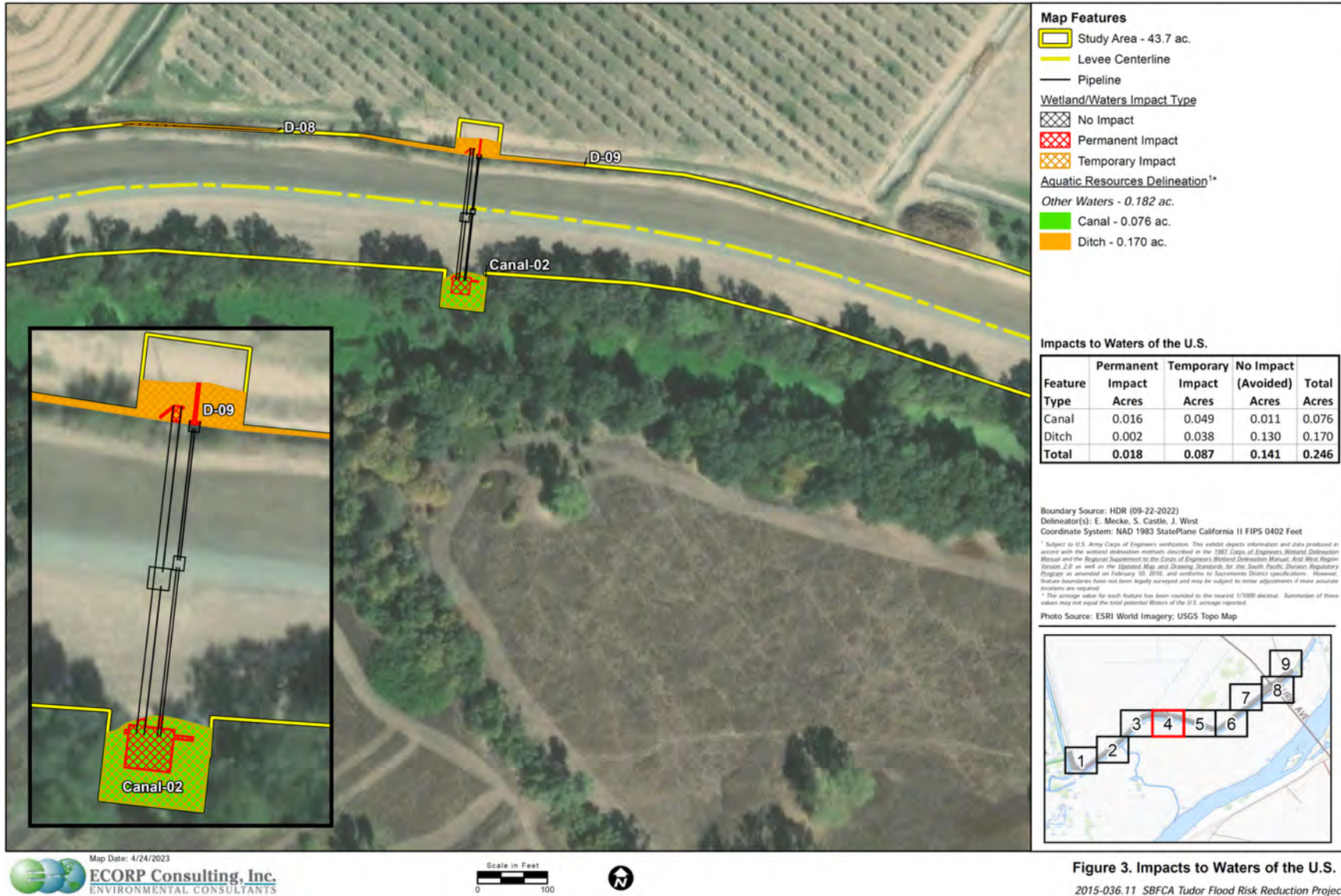
Figure 3. Impacts to Waters of the U.S. 2015-036.11 SBFCA Tudor Flood Risk Reduction Project