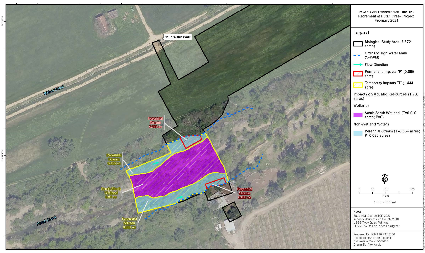
Figure 4 Impacts on Aquatic Resources