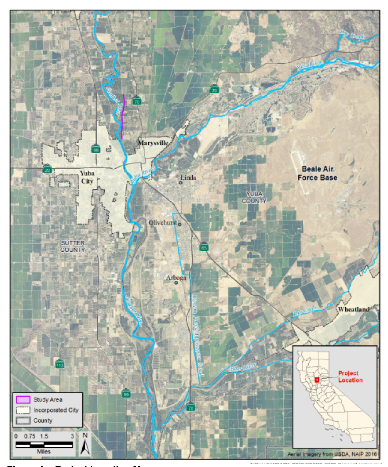
Figure 1 – Project Location Map