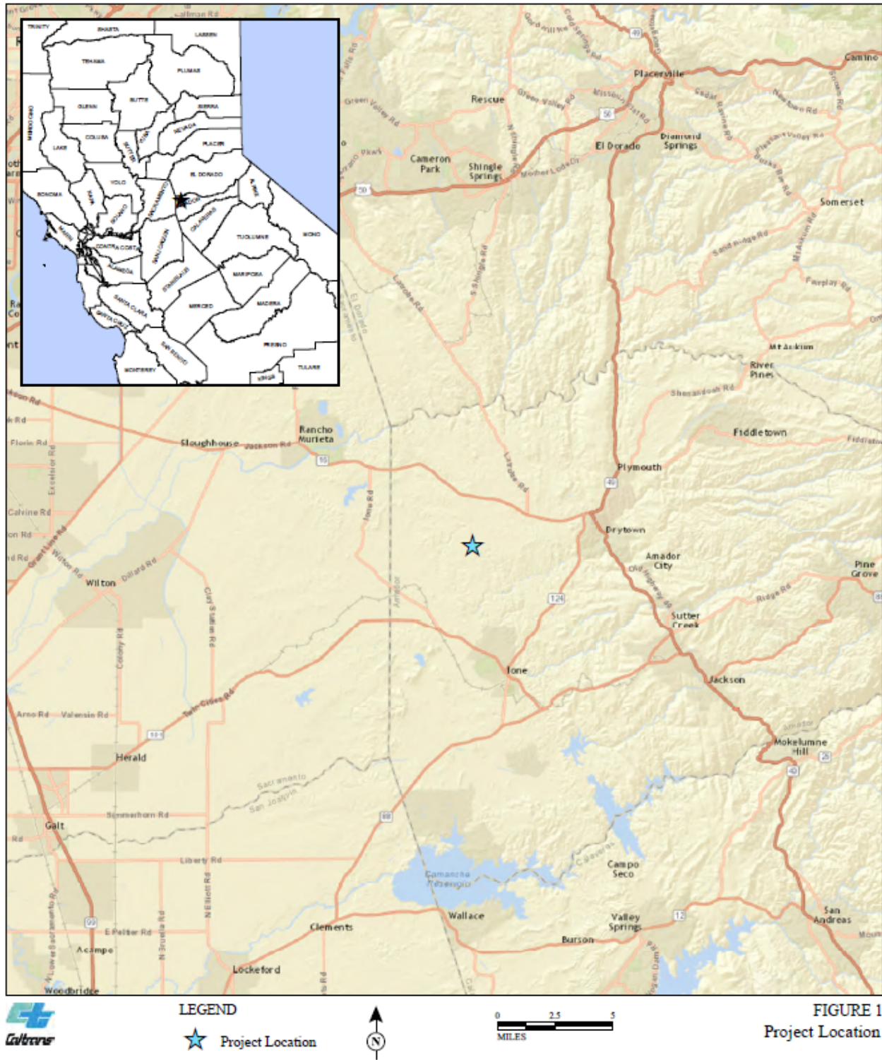
Carbondale Road Bridge (26C0030) over Willow Creek Replacement Project