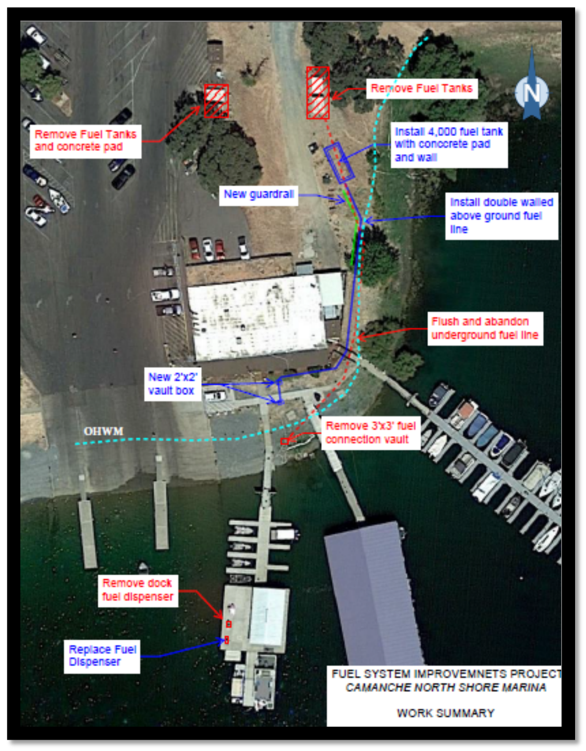
Figure 2: Project Area Work Overview