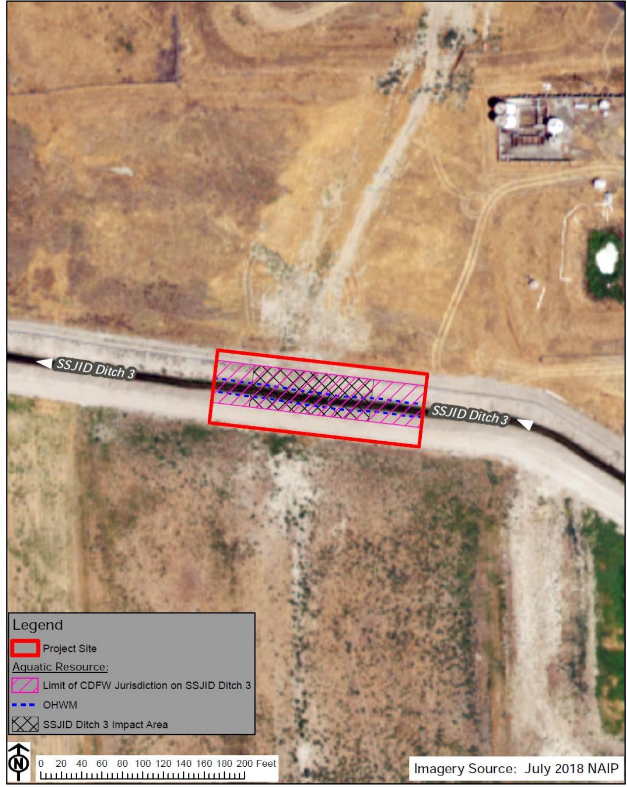
Figure 2: Project Impacts Map