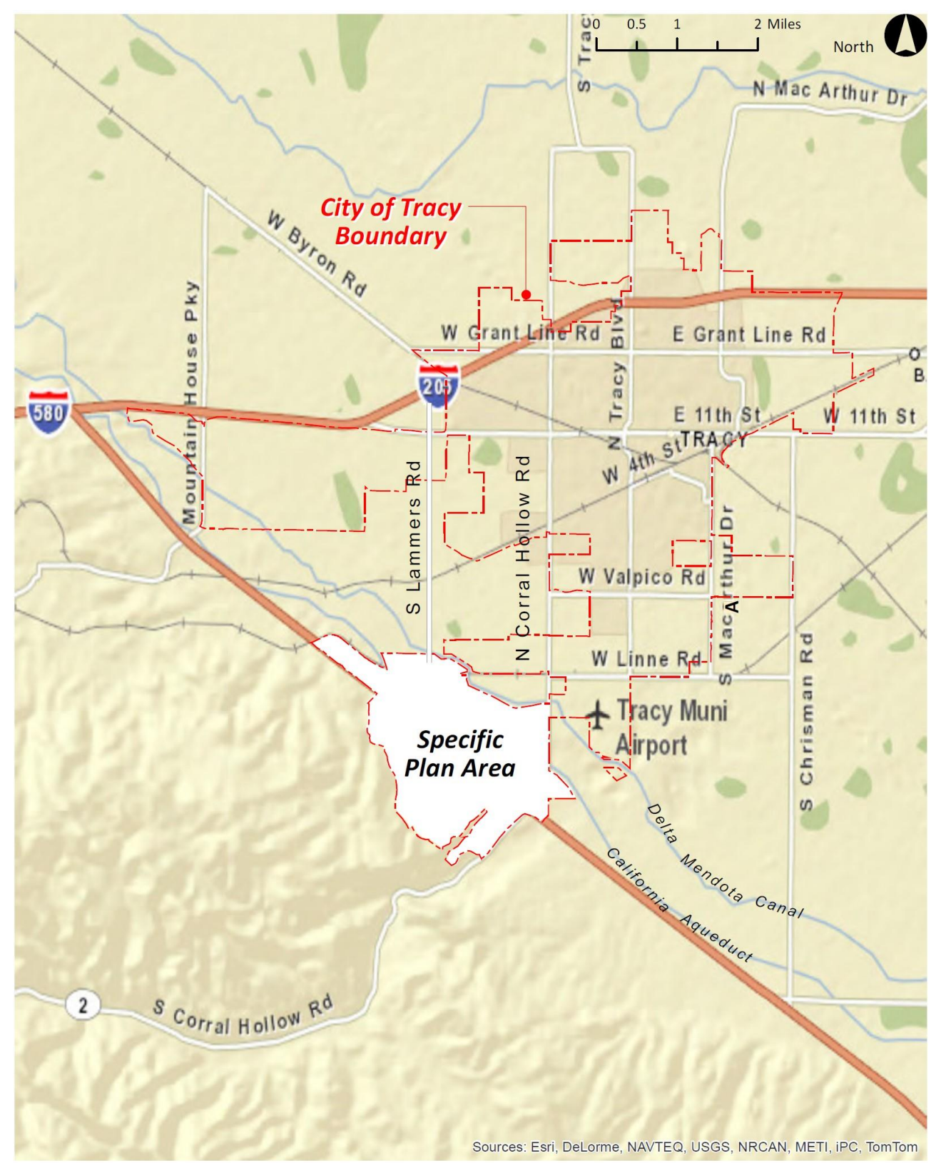
Figure 1 – Project Location Map