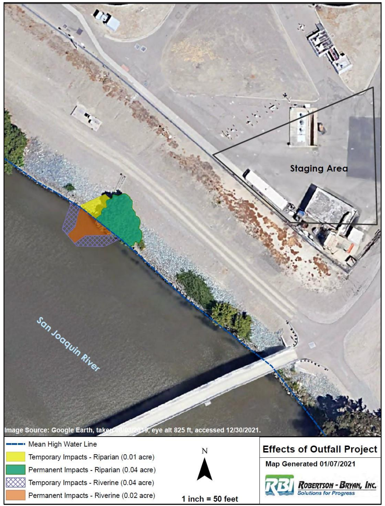
Figure 2: Project Impacts Map