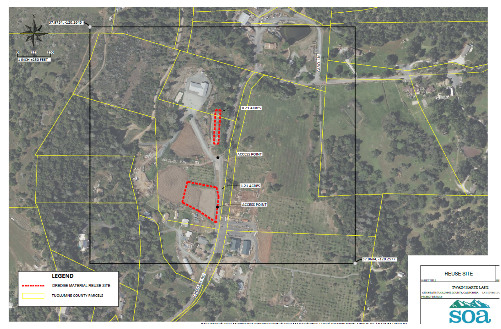
Figure 3: Map of Dredge Material Reuse Site

20 November 2023 Twain Harte Lake Dredging Project R5-2022-0052-001