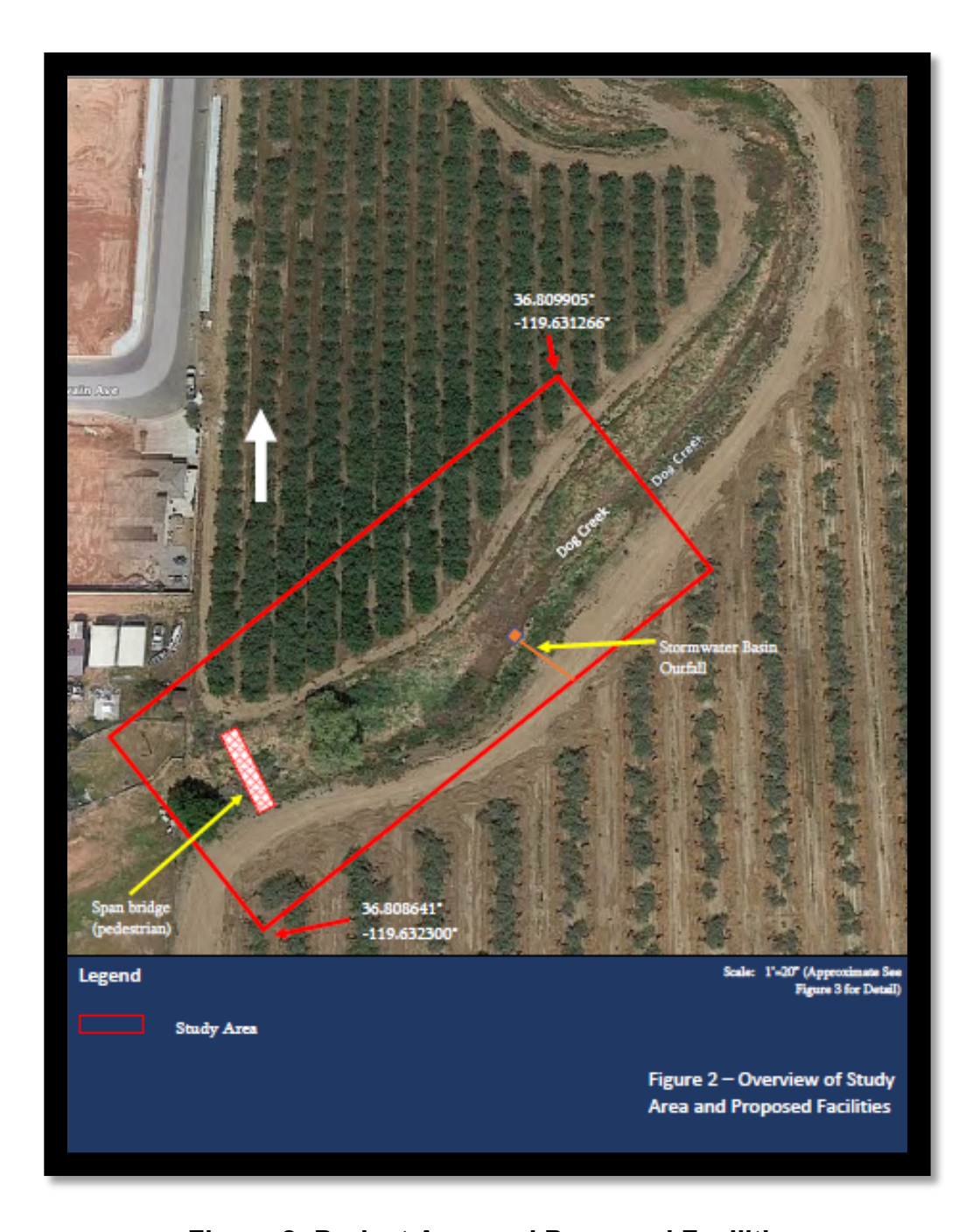
Figure 2: Project Area and Proposed Facilities