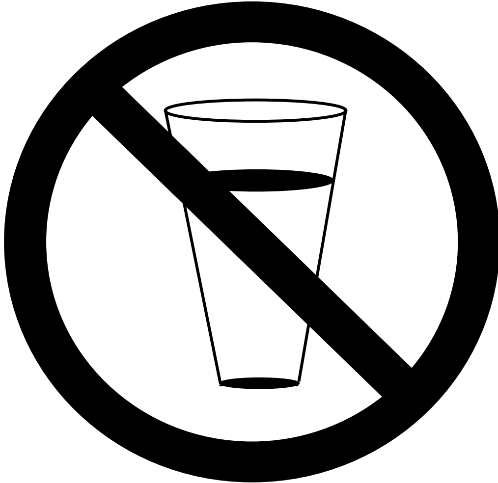
“Acceptable Symbol for DO NOT DRINK”