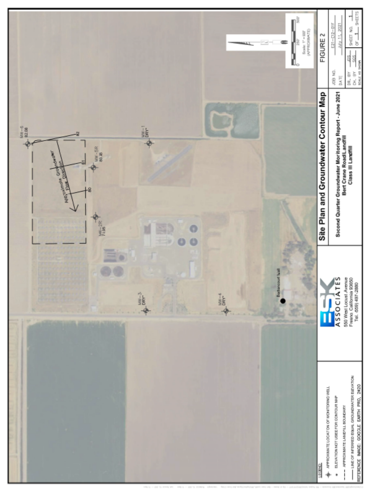
This Figure was taken from the Second Quarter 2021 Groundwater Monitoring Report.