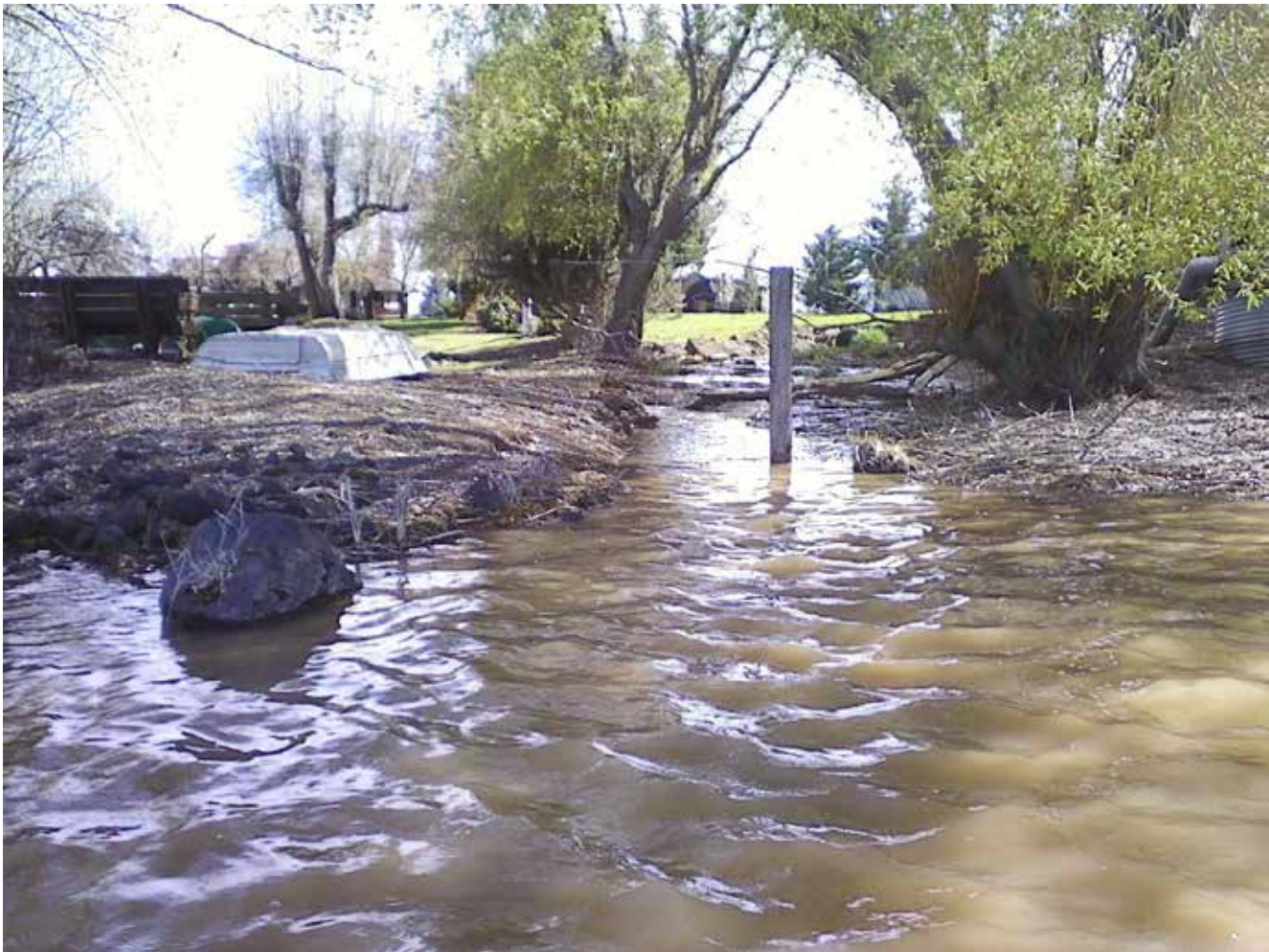
Photo 2. Point of tailwater discharge to Little Tule River. Sample #1 collected at this location.