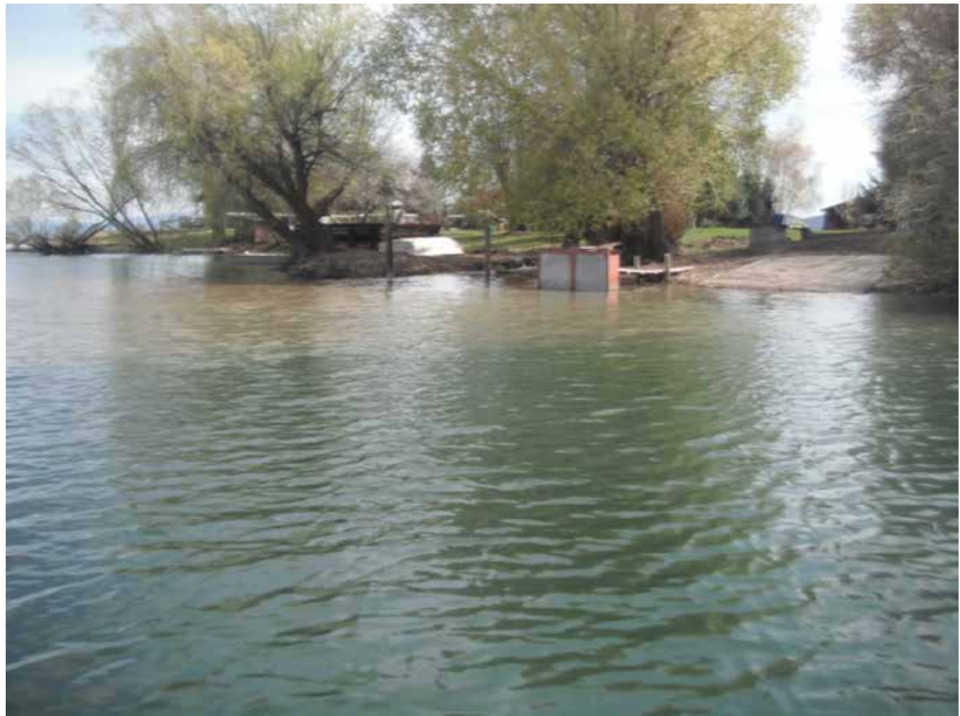
Photo 3. Well mixed zone between Little Tule River and rice tailwater discharge. Sample #2 collected at this location.