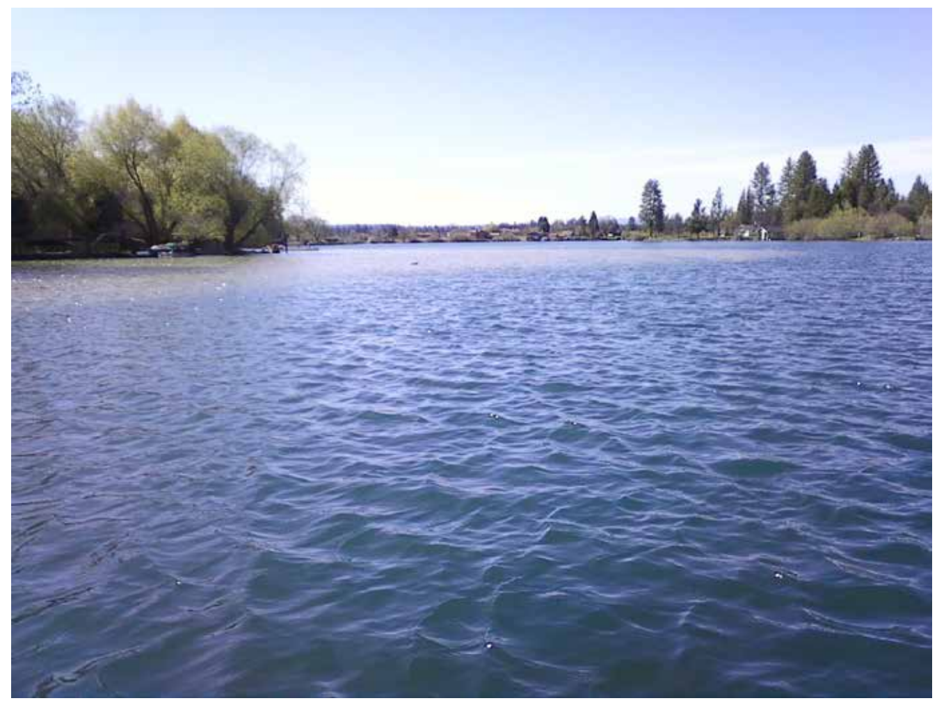
Photo 1. Little Tule River approximately 300 feet to the east of the discharge point. Sample #3 collected at this location.