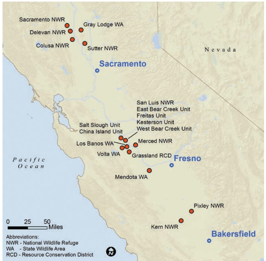
Critical Central Valley refuges and easement lands