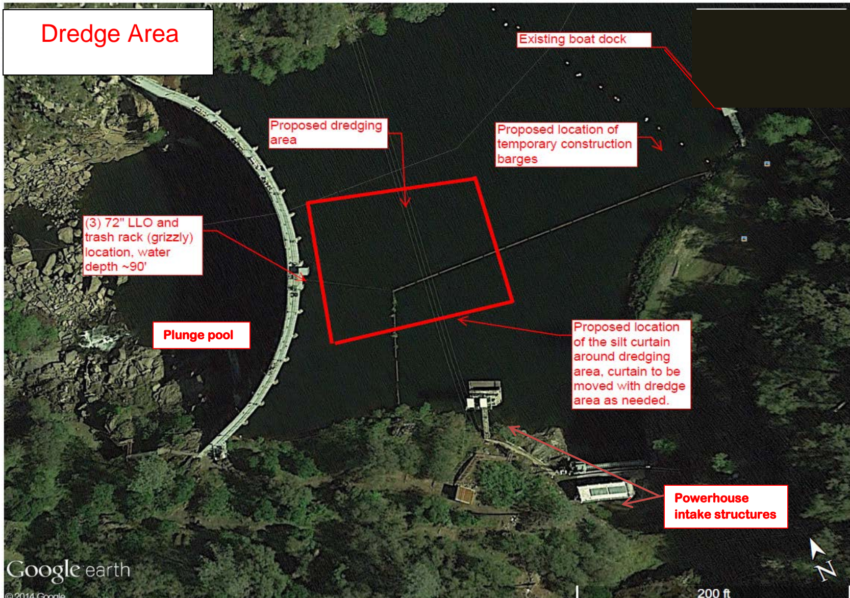
Figure 3- Dam Project Dredge Area