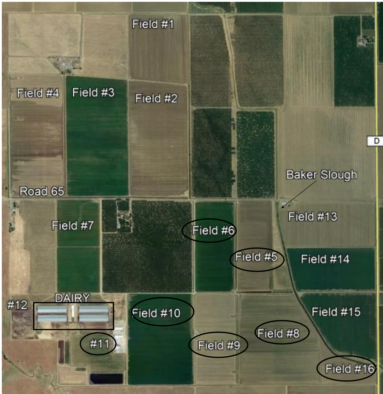
Adapted from Figure 1 of the 2018 Annual Groundwater Monitoring Report prepared by Provost & Pritchard for the J.G. Weststeyn Dairy.