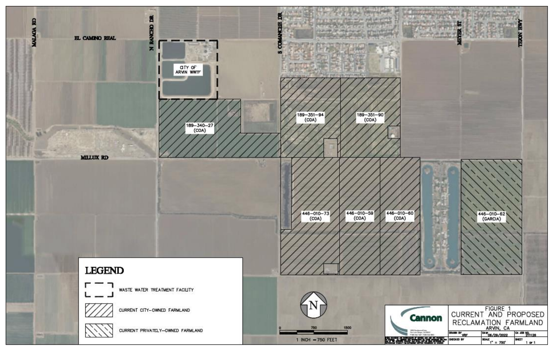
Figure 1 Land Application Areas Currently Available for Wastewater Recycling

The map shown in Figure 1 was provided by the City of Arvin in a Water Balance Report dated 21 July 2022