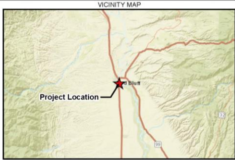
FIGURE 200.1 Facility Location Map