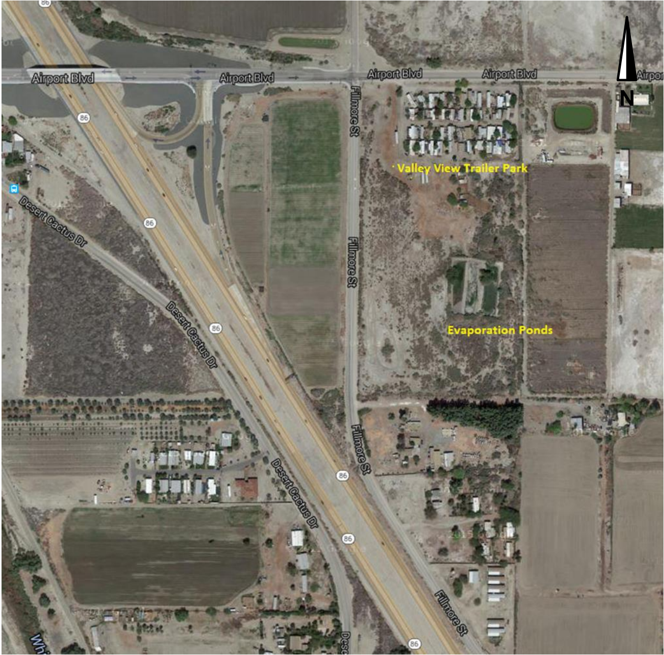
VICINITY MAP VALLEY VIEW TRAILER VILLAGE DOMESTIC WASTEWATER TREATMENT SYSTEM Thermal - Riverside County Board Order R7-2016-0023