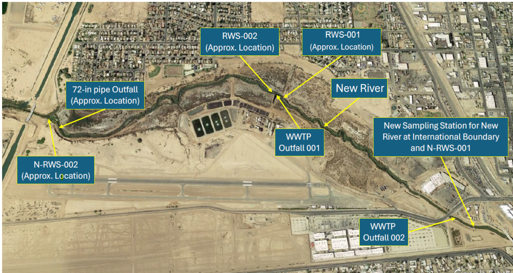
City Of Calexico Calexico Water Pollution Control Plant Facility Location - NW \frac{1}{4} of the SW \frac{1}{4} of Section 14, T17S, R14E, SBB&M Discharge to New River - 32°, 40', 17" N; 115°, 30', 45" W and 32°, 39', 56.37" N; 115°, 30', 9.01" W

New River Improvement Project's 72-inch Pipe Outfall