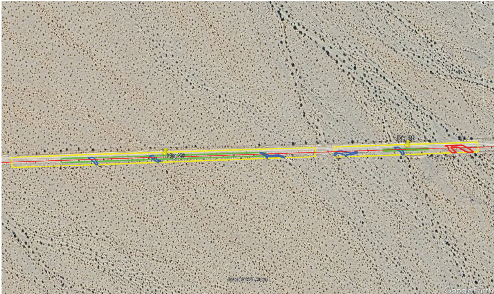
Figure 2: Example of project locations (outlined in yellow) with blue outlining impacted Waters of the State under jurisdiction of the Colorado River Basin Water Board and red polygon showing avoided Waters of the State.