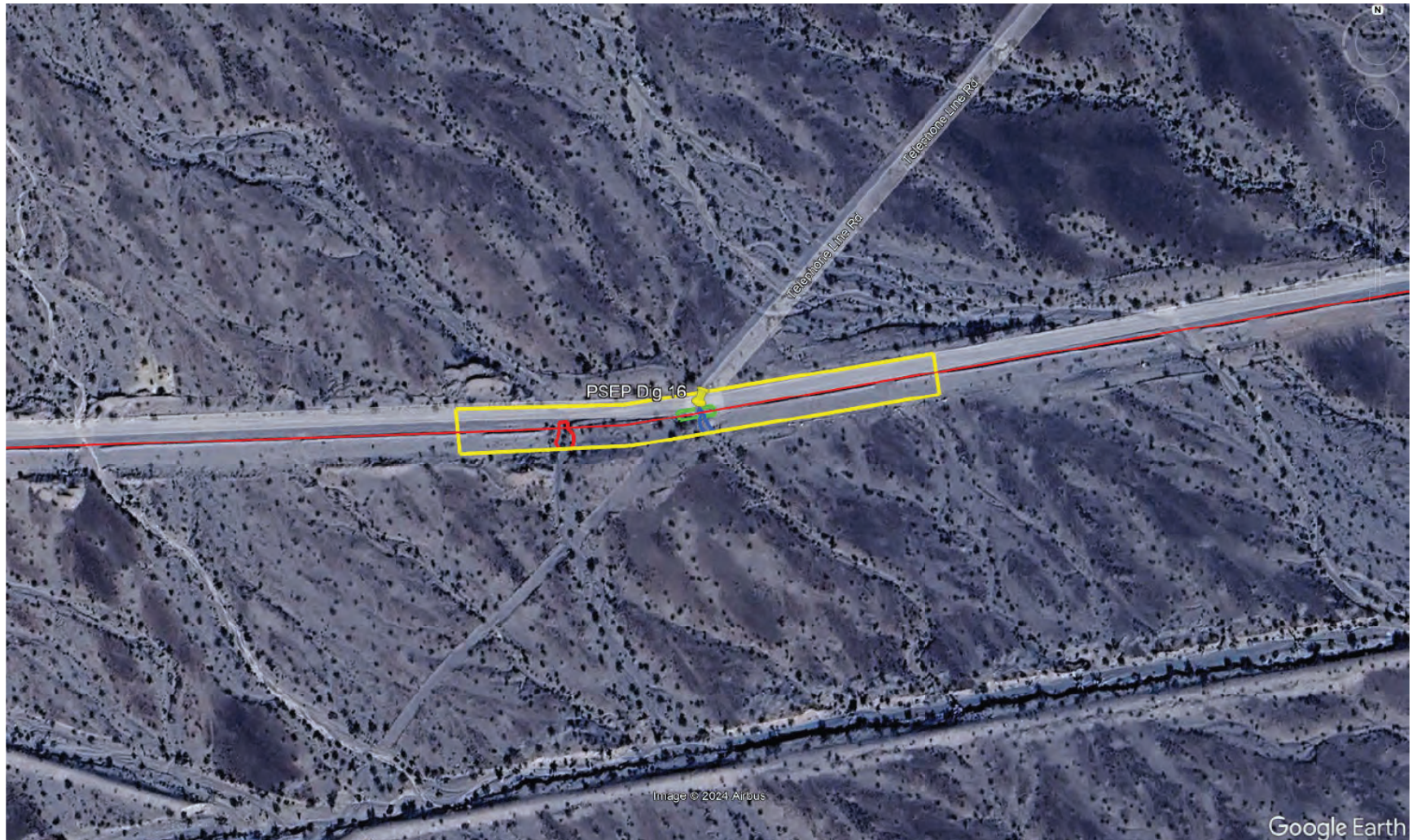
Figure 3: Second example of the project location (outlined in yellow) with blue outlining impacted Waters of the State under the jurisdiction of the Colorado River Basin Water Board and red polygon showing avoided Waters of the State.