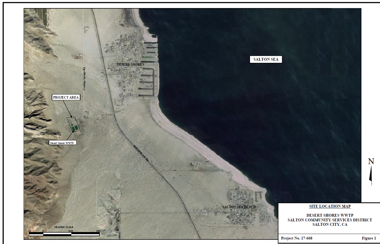
Figure 1. Map with Facility Location