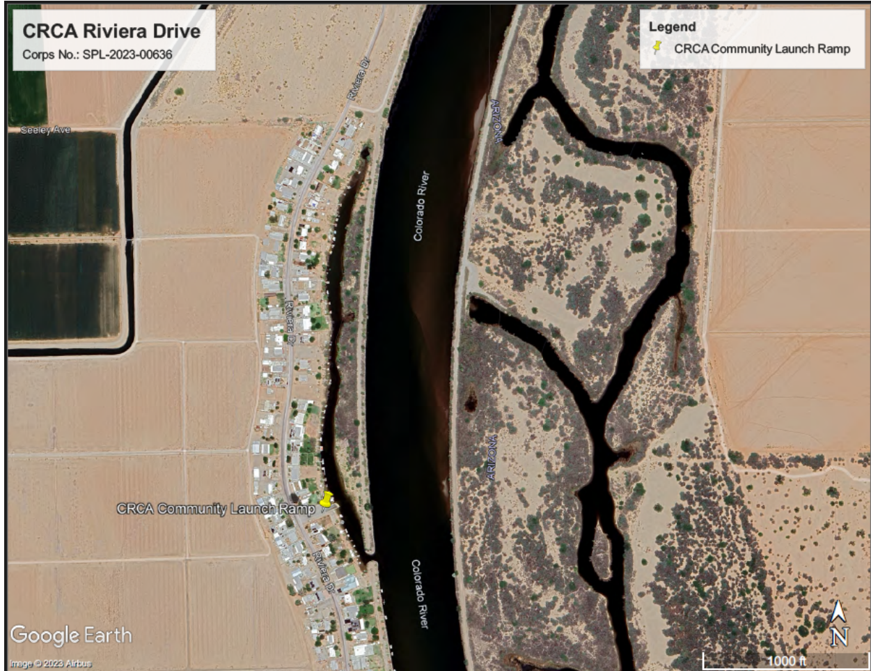
Figure 1. General vicinity of the Project site. 1