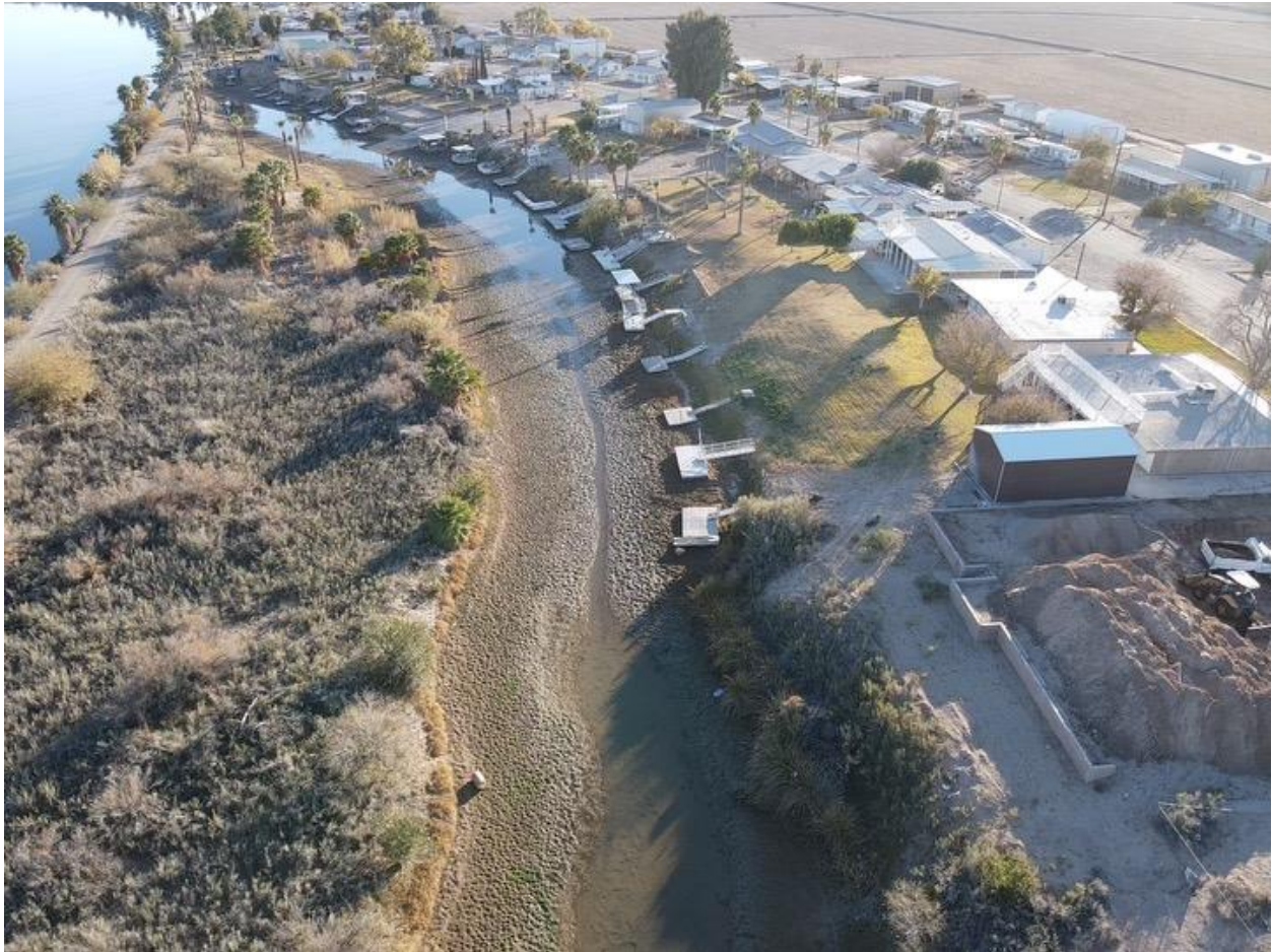
Figure 3. Aerial image of the Project area (view south).