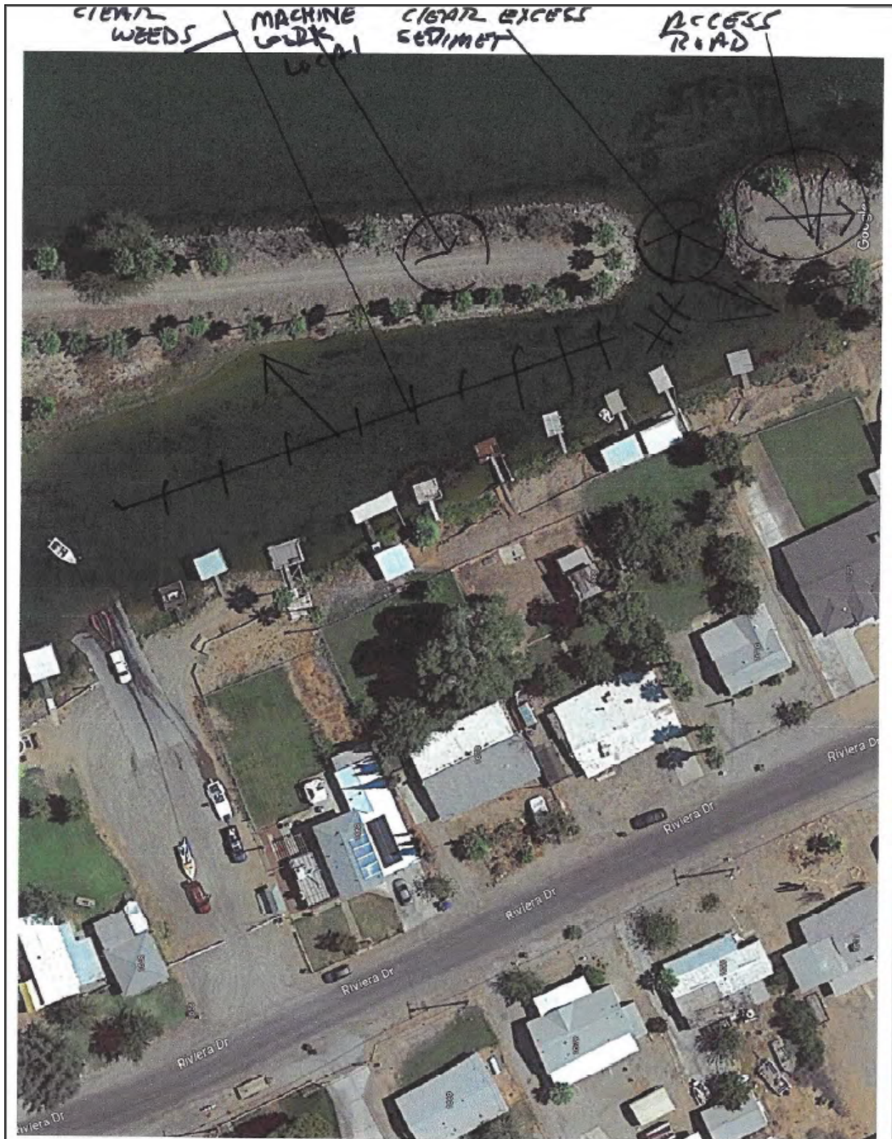
Figure 4. Aerial image of temporary impact area showing locations of Project activities.