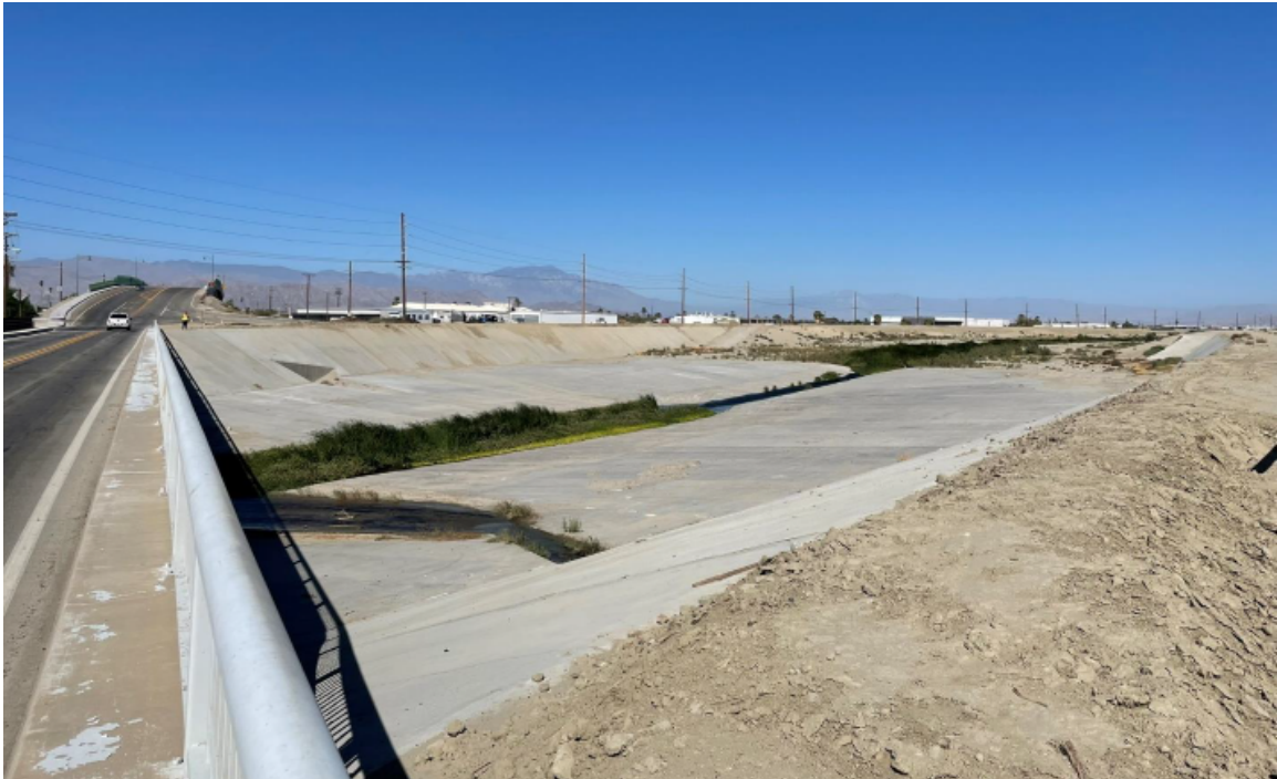
Figure 5: Northern portion of Airport Boulevard Bridge and the Coachella Valley Storm Water Channel upstream of the Project.