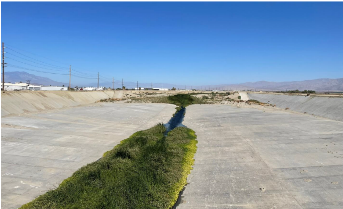
Figure 6: Coachella Valley Storm Water Channel upstream of the Project area.