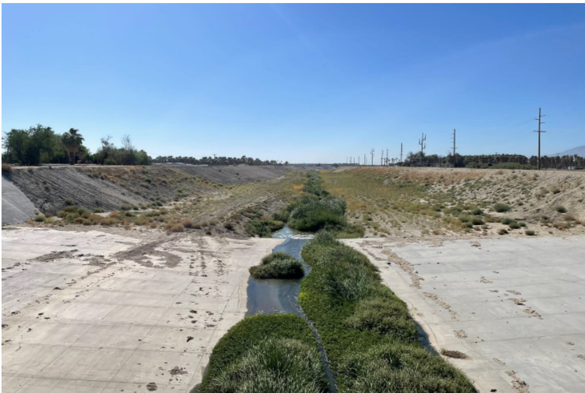
Figure 8: Coachella Valley Storm Water Channel downstream of the Project area.