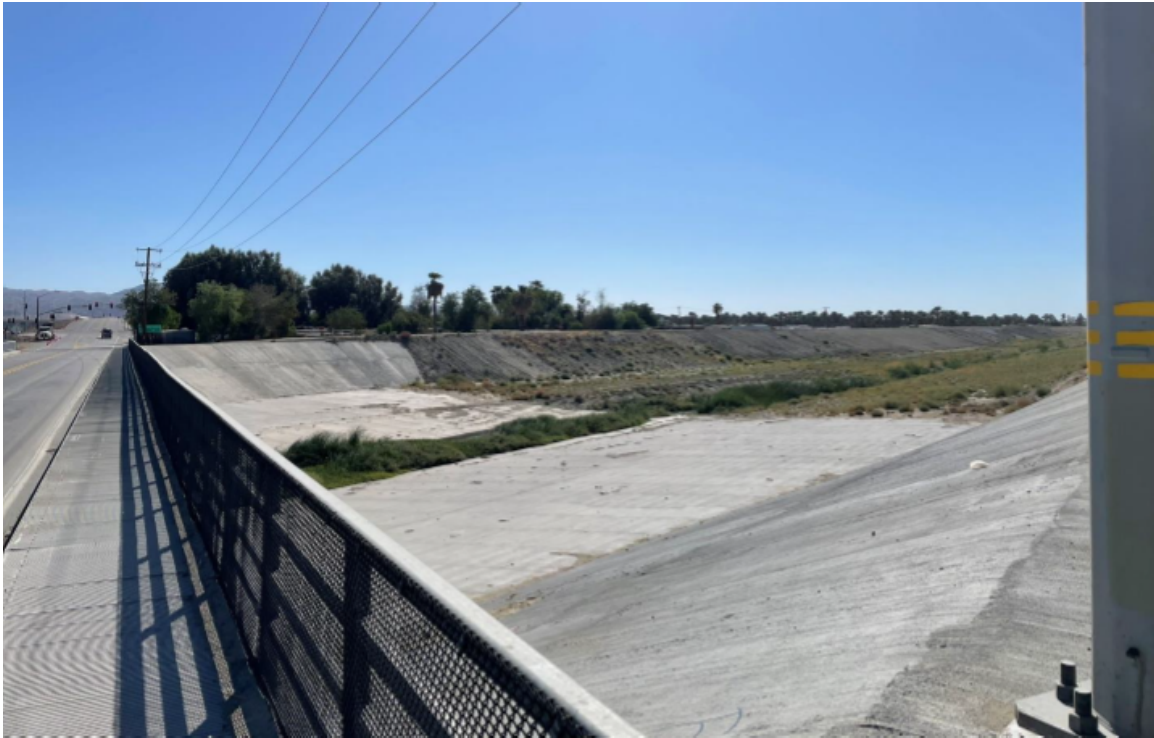
Figure 7: Southern portion of Airport Boulevard Bridge and the Coachella Valley Storm Water Channel downstream of the Project.