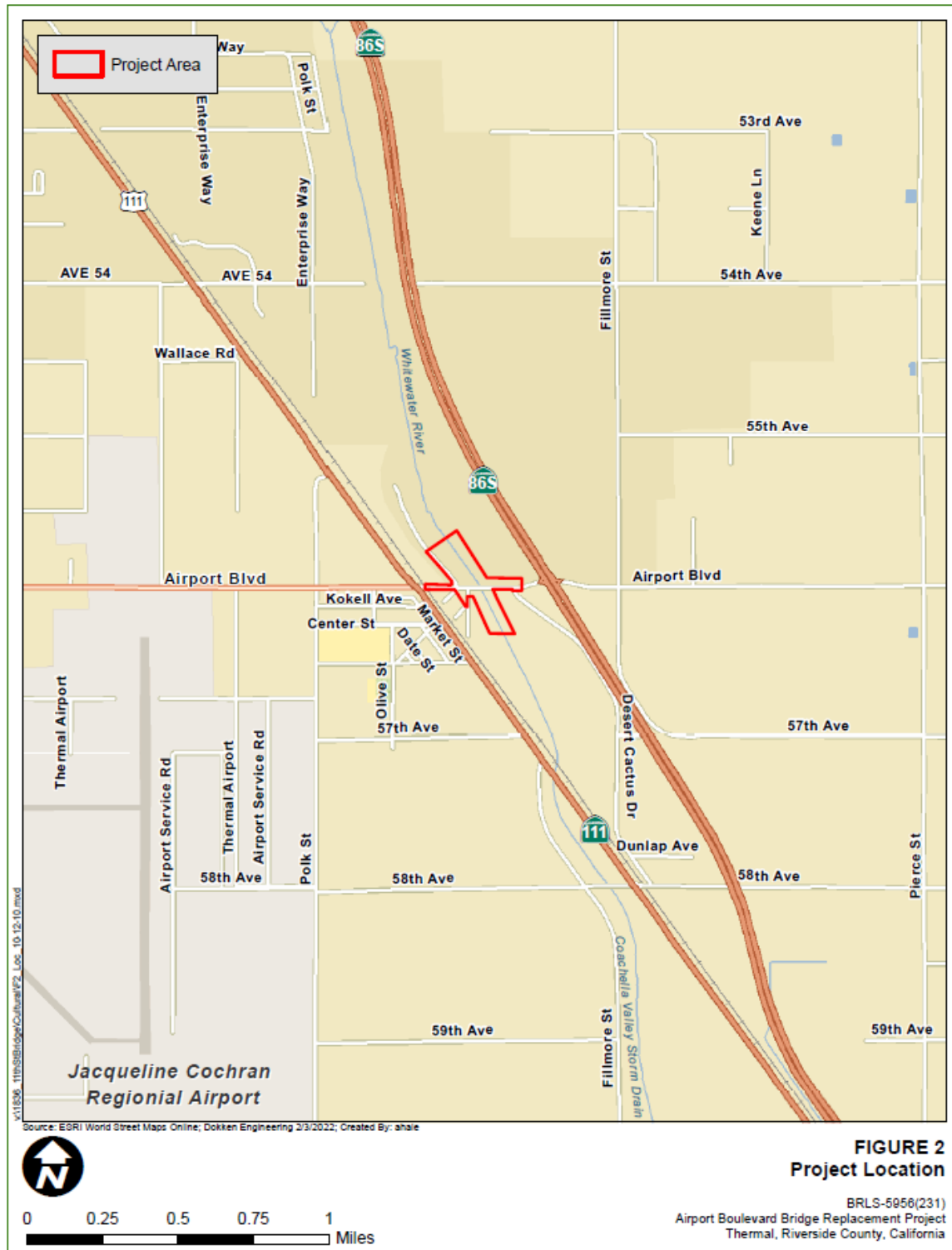
Figure 2: Project area and local vicinity.