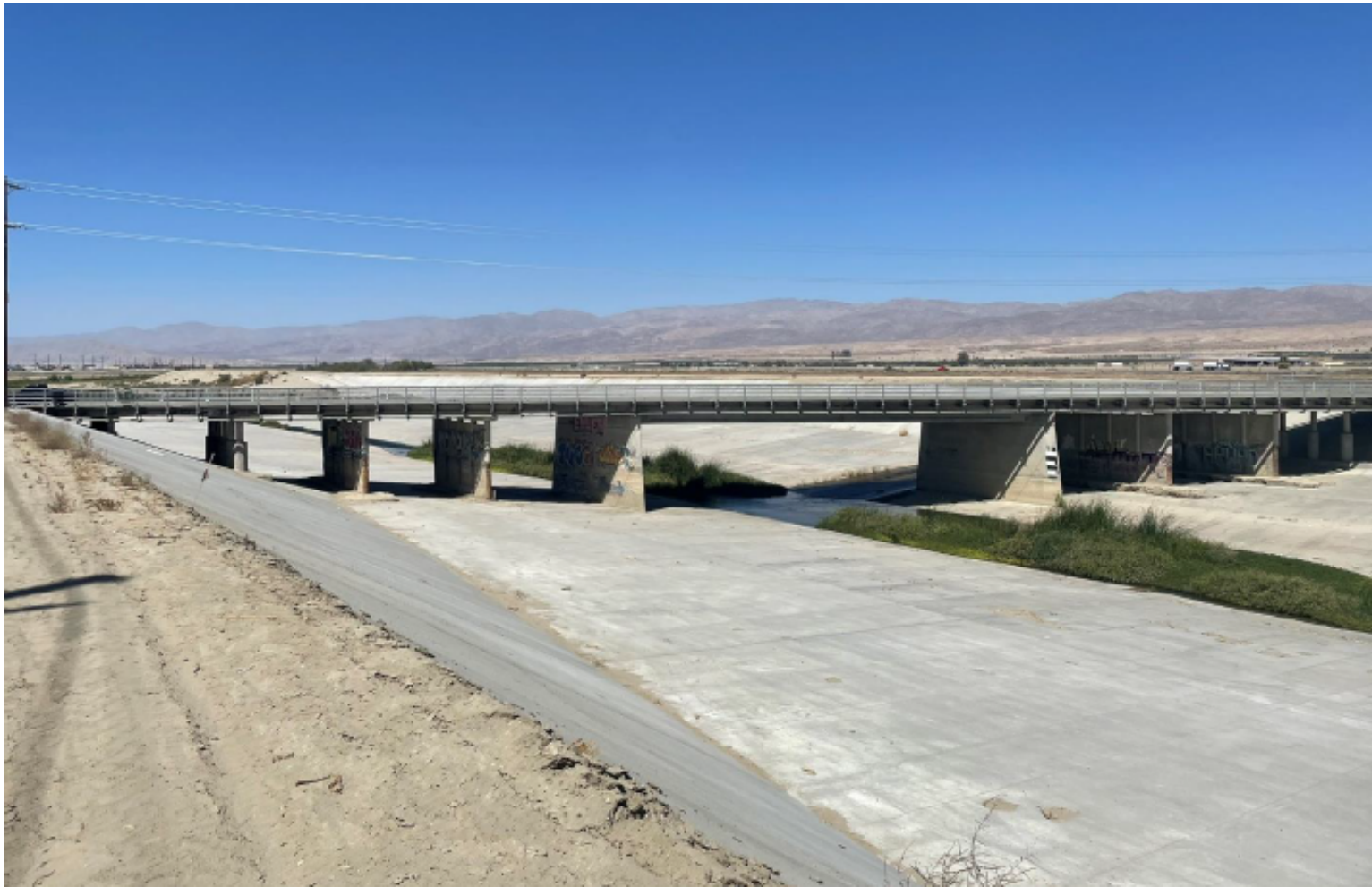
Figure 4: Photo of Airport Boulevard Bridge.