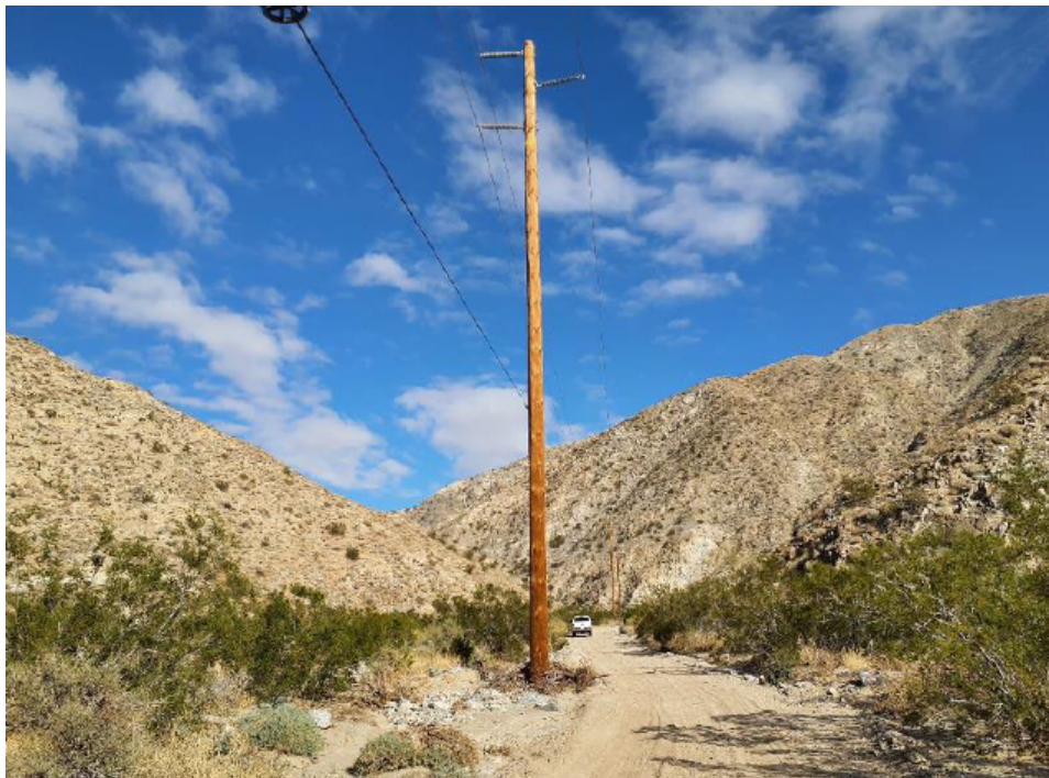
Photograph 2: Pole 4632900E Overview. Photo Facing North (Upstream)