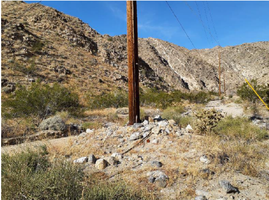
Photograph 1: Pole A13721193E Base. Photo Facing Northwest (Upstream)