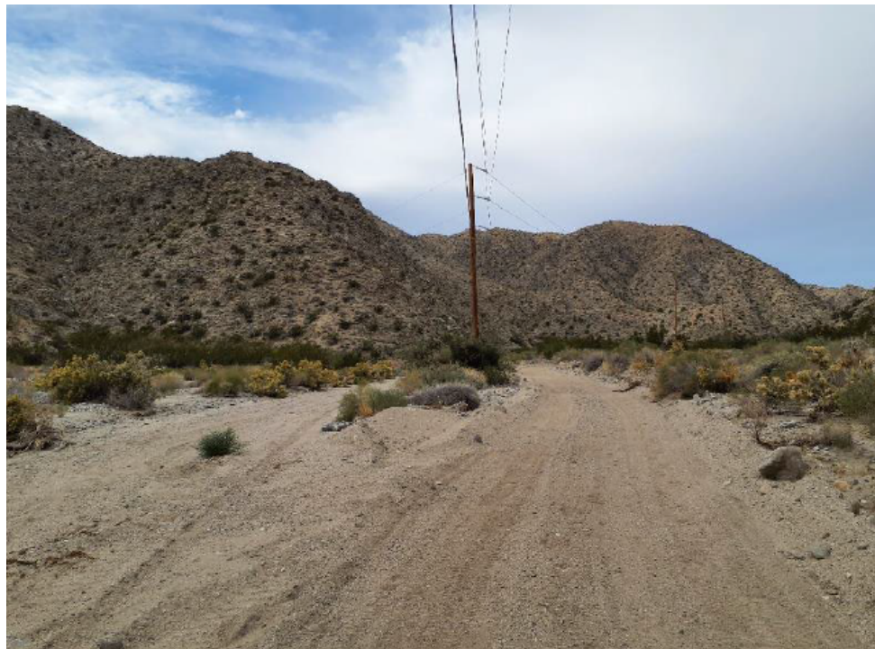
Photograph 4: Little Morongo Canyon Road Leading to Pole 4617975E. Photo Facing North (Upstream)