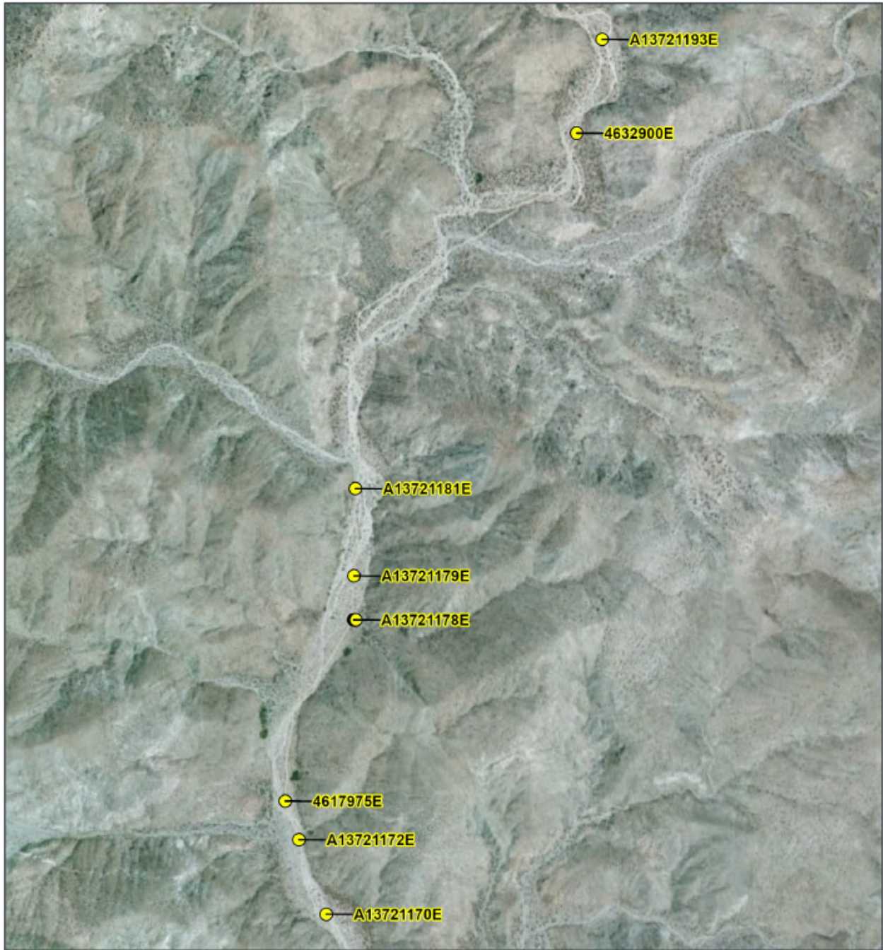
Figure 2: Local Vicinity Map Showing Pole Replacement Sites