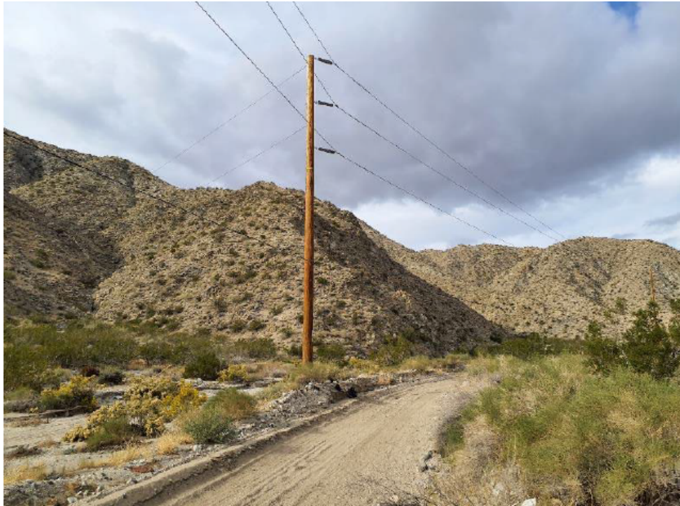
Photograph 3: Pole 4617975E Overview. Photo Facing Northwest (Upstream)