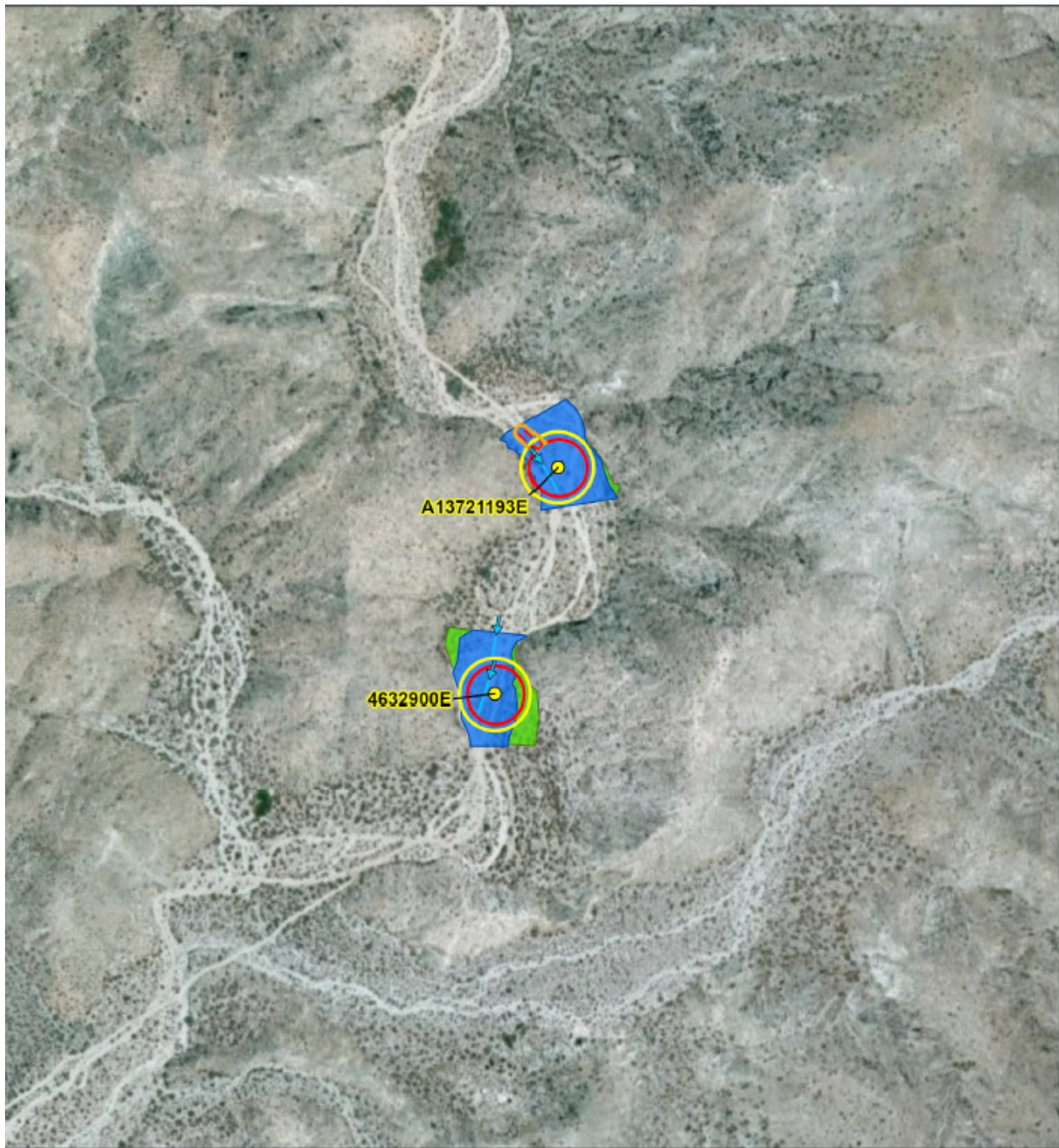
Figure 3: Mapped Jurisdiction: Poles A13721193E and 4632900E