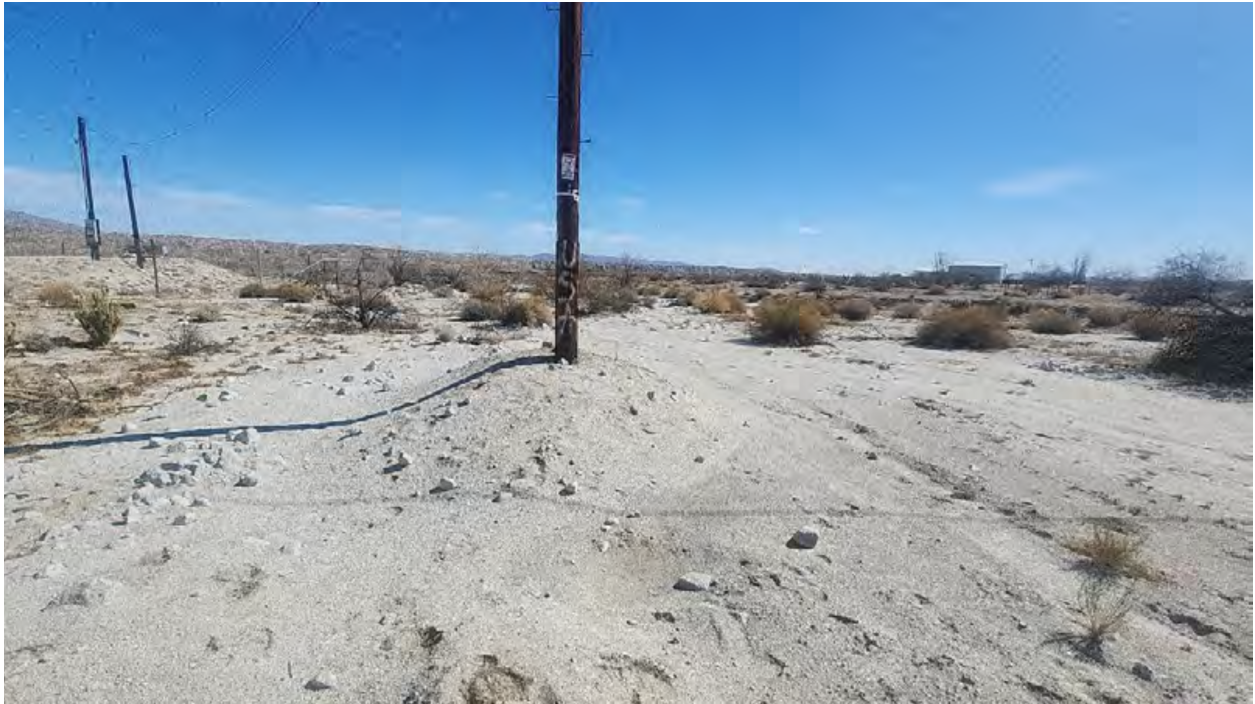
Figure 3. Photo of site and deteriorating pole facing south.