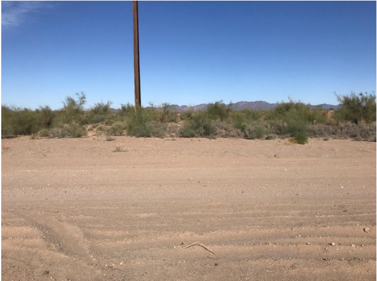
Figure 3: Photograph facing west of Buck Blvd as it crosses the ephemeral wash.