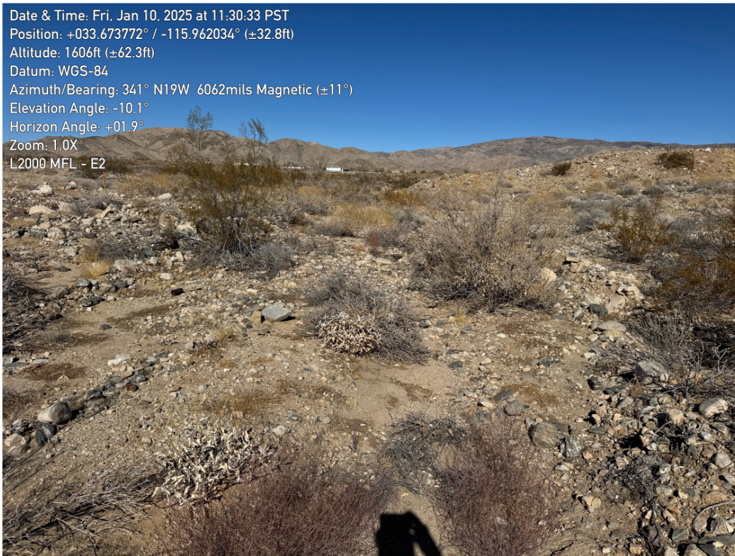
Figure 4: Site image of Ephemeral Wash Upstream looking north from the Project site.