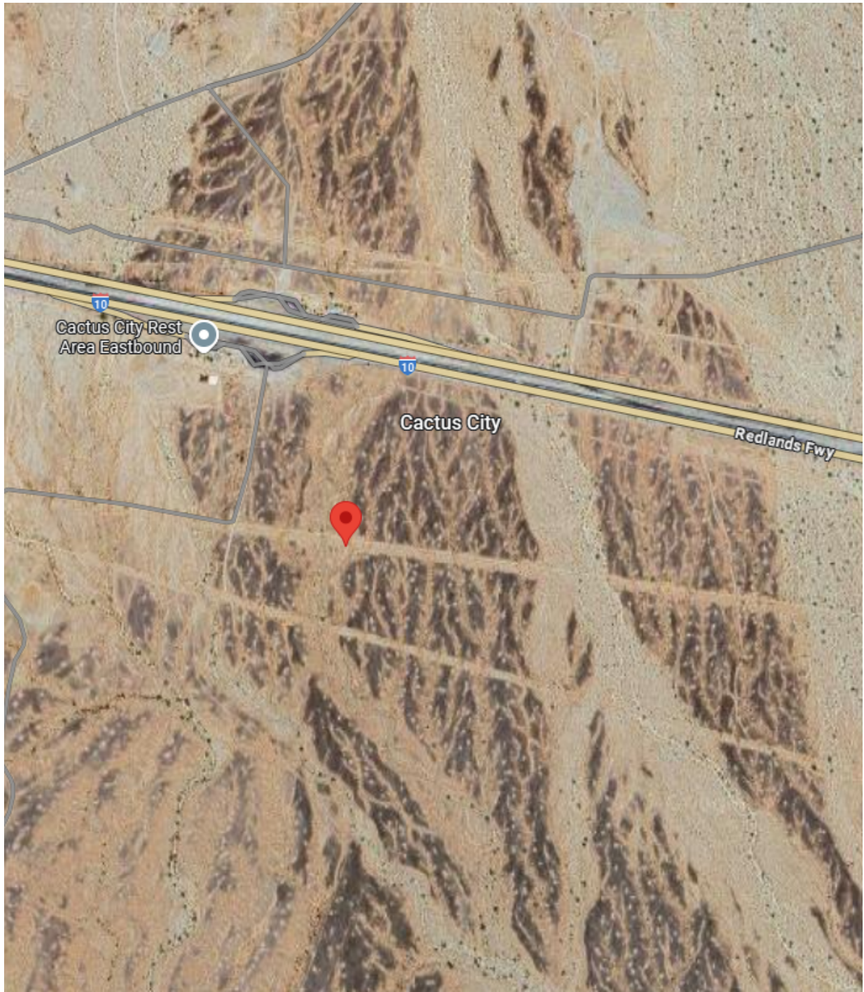
Figure 2: Vicinity Map