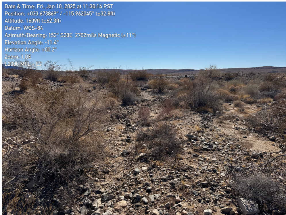
Figure 5: Site image of Ephemeral Wash Downstream looking south from the Project site.