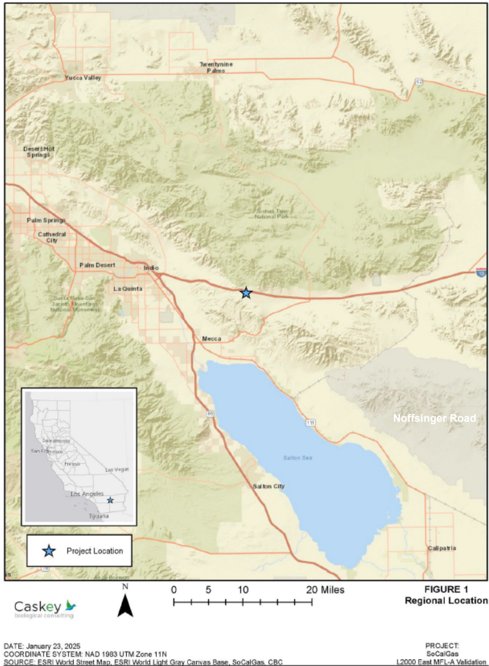
Figure 1: Regional Map of Site 1