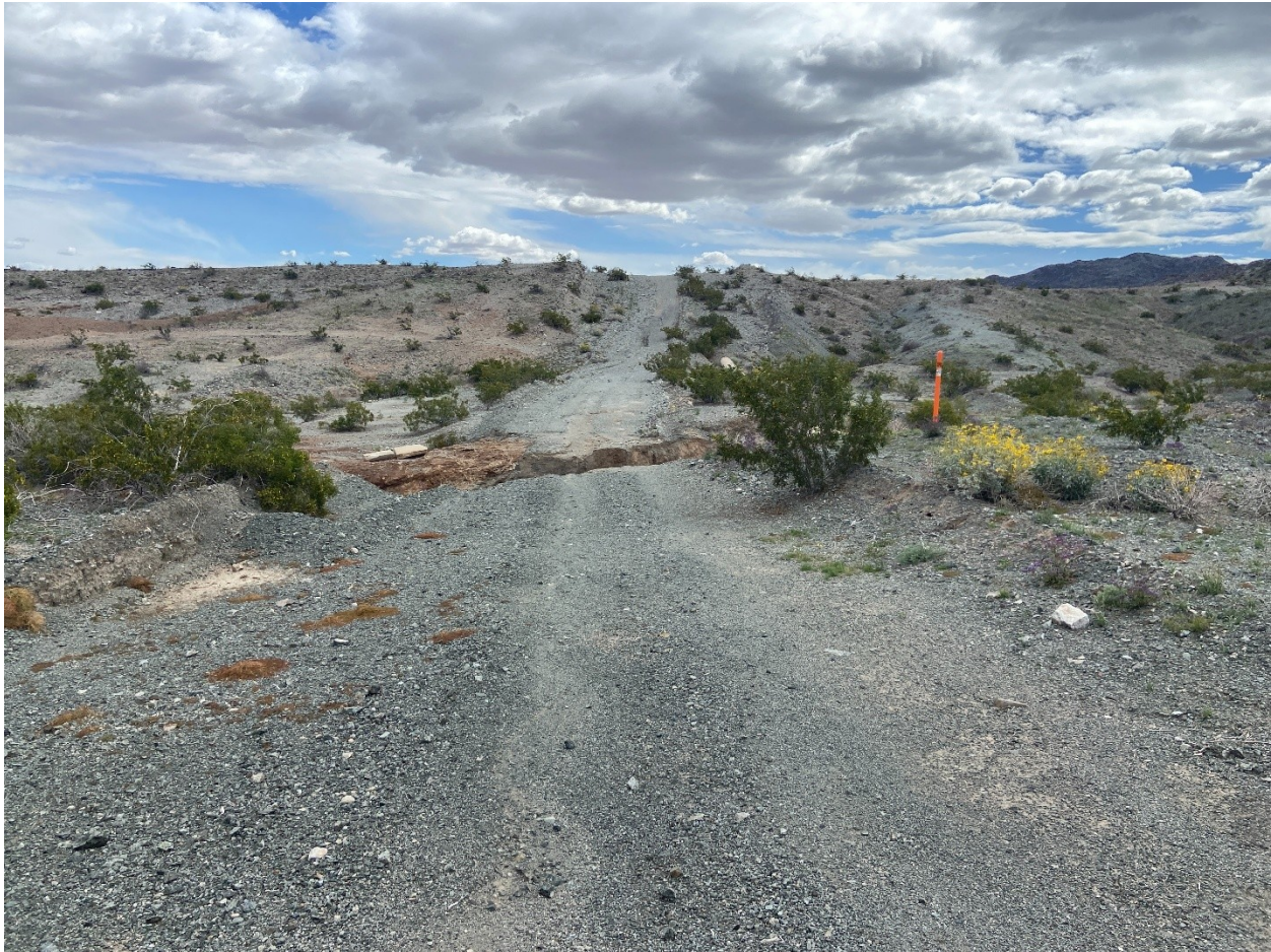
Figure 3. Project site, image of damaged access road. Photo facing East.