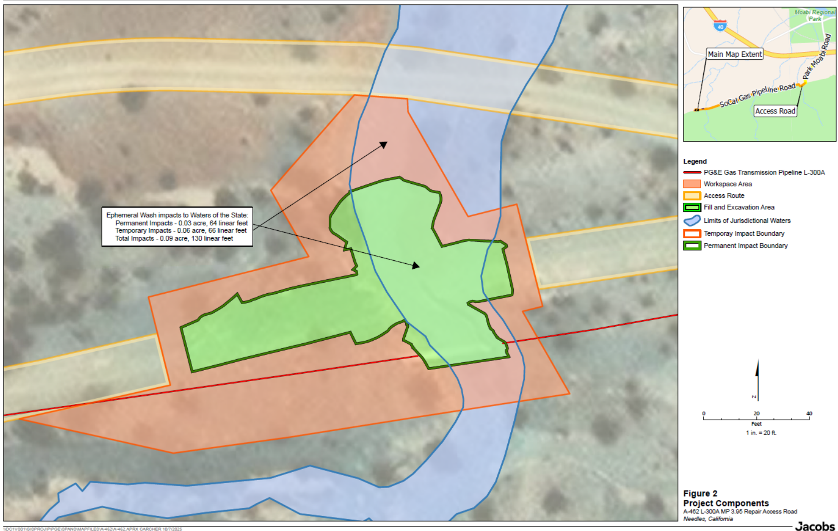
Figure 2. Work are and jurisdictional map.