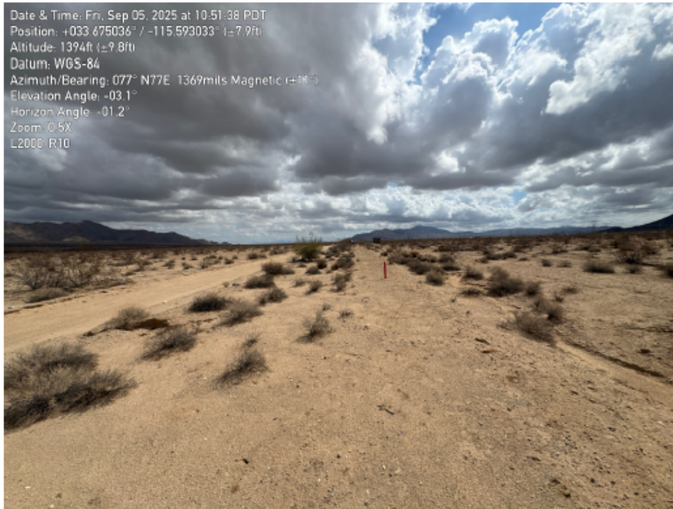
AG2020S1P1-R10 Work Area