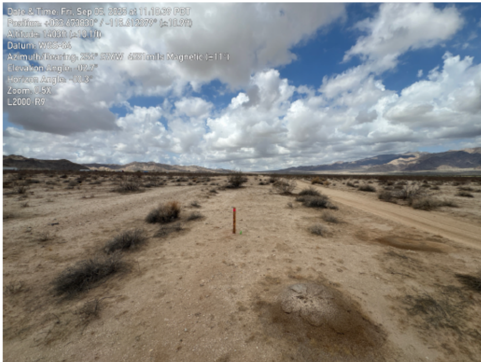
AG2020S1P1-R9 Work Area