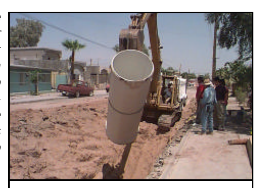
Figure 214 - South Collector repairs underway (Jul 1998)

"A major recent bypass of raw sewage from the South Collector to the New River has been eliminated, at least for the most part. The bypass occurred because of a collapsed line. The efforts by Mexico to deal with this problem in expedient fashion are commendable considering the magnitude of the problem and resources needed (e.g., over $120,000 dollars) to deal with the problem."