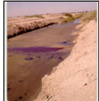
Figure 201 - Discharge from Slaughterhouse (Oct 1997)

On January 8, 1998, U.S. Senator Barbara Boxer met in El Centro with Imperial Valley constituents and policy makers to discuss, amongst other topics, border infrastructure and New River pollution. During the meeting she stated that come February "...the Federal government's goal will be to issue a complete financial analysis of the next phase of the polluted river's cleanup and to secure a $10 to $15 million loan for the execution