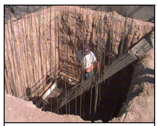
Figure 210 - Construction of cistern at Pumping Plant No. 3 (Jul 1998)

The Gonzalez-Ortega lift station is fully operational. At Pumping Plant No. 3, CESPM began building a cistern to provide sufficient water pressure to the new pumps' lubrication system. The cistern should be finished within one week. At the time of the tour, all three pumps were operational, and the plant operator reported that the pumps now operate in automatic mode. Reportedly, the flow meters at this plant have been calibrated. but the total flow recorder is still not operational. At Pumping Plant No. 1, one pump was down because of a bad shaft. Currently, this is not a problem since the four new pumps/motors are