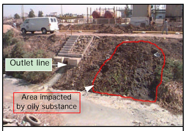
Figure 207 - Discharge from Hidrogenadora Nacional (Mar 1998)

"Hidrogenadora Nacional continues to discharge wastes into the drain evidently without regard for unsightly conditions or adverse water quality impacts it may create...its outlet line located about 0.51 miles north from Highway 2, was discharging approximately 5 lps of steamy, greasy wastewater with a milky-brown tint into the drain...Further, at approximately 10 feet south from the outline, someone evidently dumped a black oil-