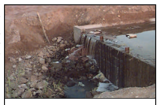
Figure 206 - Alamo River weir (Jan 1998)

During the February 3, 1998 Binational Technical Committee (BTC) meeting in Mexicali, the U.S. section of the committee