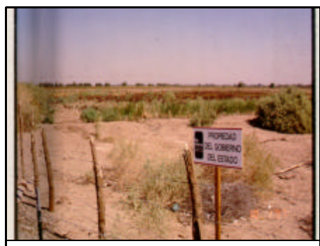
Figure 200 - Proposed site for Mexicali II WWTF (Oct 1997)

The proposed Mexicali II project has an estimated cost of $50 million dollars. It received conditional and final certification by the BECC on December 5, 1997, and January 7, 1998, respectively. The final financing plan including Federal, State and local funds is being developed to pay for project costs.