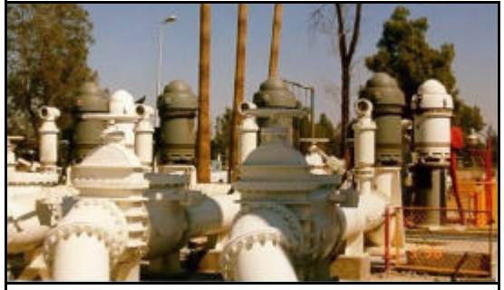
Figure 202 - Pumping Plant No. 1. The new pumps are shown in gray color (Jan 1998)

"Pump Station No. 1 - Only Pumps No. 5 and 6 were operating at the time of the tour. Pumps No. 1 through 4 (the new Fairbanks-Morse (zamua are not operational yet...According to Mr. Soberanes, CESPM is still working on the "wiring" for the pumps. He stated that the pumps should be fully operational within one month. Also, the on-site emergency generator is not fully operational. Mr. Soberanes stated that CESPM tested the gener-