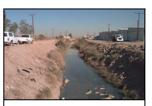
Figure 192 - Tula West Drain downstream of Hidrogenadora Nacional (Jan 1998)

CH2M Hill was not able to assess how and to what extent CNA is enforcing the regulatory discharge limits. Also, baseline data regarding the inorganic and organic characteristics of many of the discharges is not available to fully assess the water quality impacts they may be causing in the New River. However, my review of the report indicates that, of the 50 entities discharging into the New River and/or its tributaries, over 65% discharging their wastes untreated, only 21 of them (i.e., less