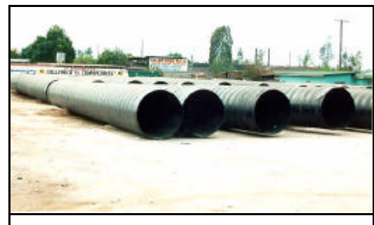
Figure 199 - Sewage force main for Mexicali II WWTF (Feb 1998)