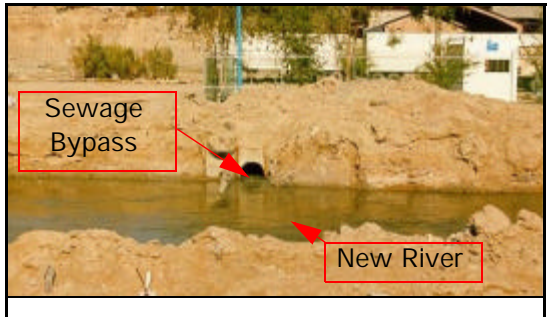
Figure 203 - Bypass from Lift Station into New River (Jan 1998)

"Right Bank Pumping Station - The station was bypassing approximately 1 million gallons per day of