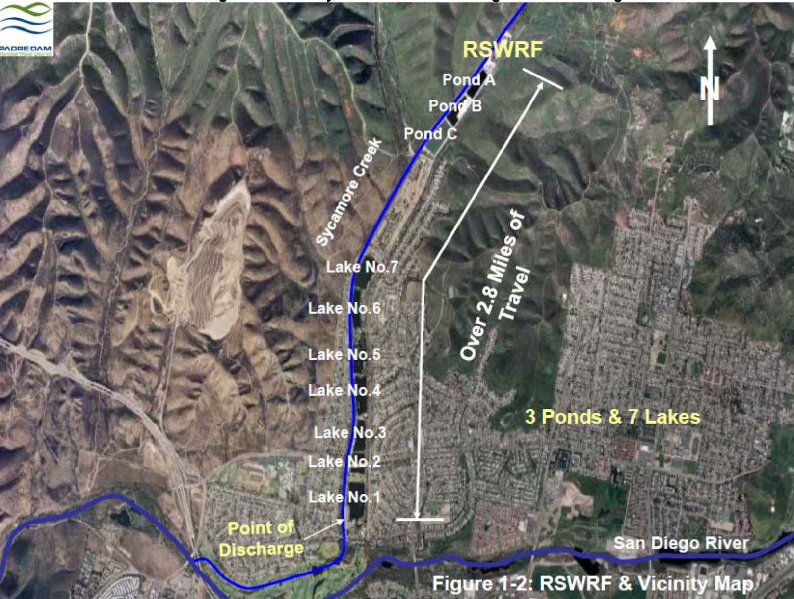
Figure B-2. Facility Location and Receiving Water Monitoring Stations