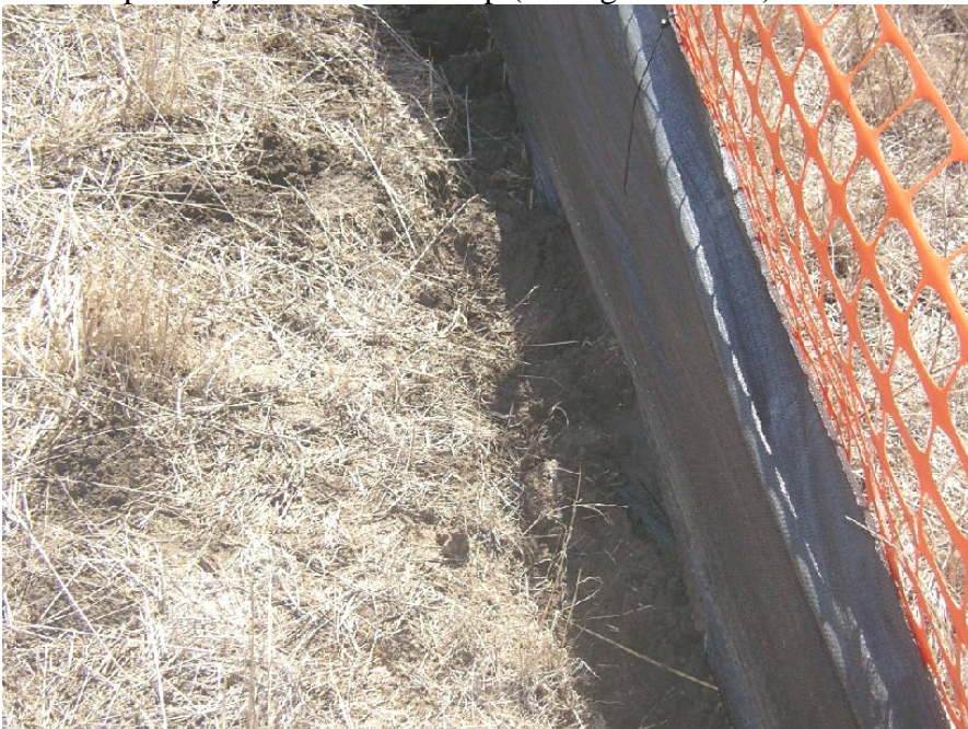
Photo 6 Example of Incorrect Silt Fence Installation (Not Trenched In)