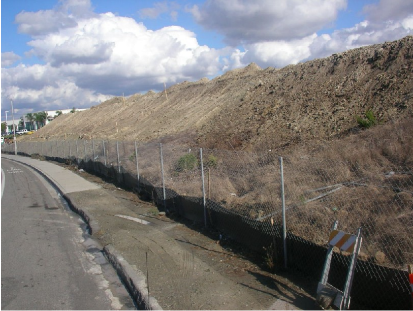
Photo 3 Example No Erosion Control on Exterior Slopes (Facing Northeast on College Ave)