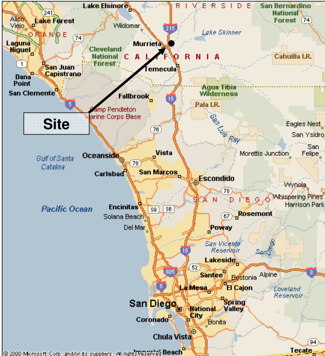
FIGURE 1 Eastern Municipal Water District Sanitary Sewer Overflow

Site Address 28079 Diaz Road, Temecula WDID No. 9 00000763